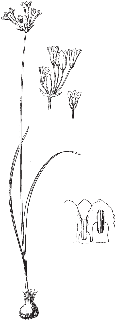
FIGURE 1. Illustration of Triteleia howellii (Line drawing in Pojar 2001).

extremely rich low shrub and herb stratum is present during the spring. The most prominent species in the Cowichan Garry Oak Preserve Garry Oak stand are Sanicula crassicaulis var. crassicaulis and Dactylis glomerata (Douglas et al. 2002*). Other species with