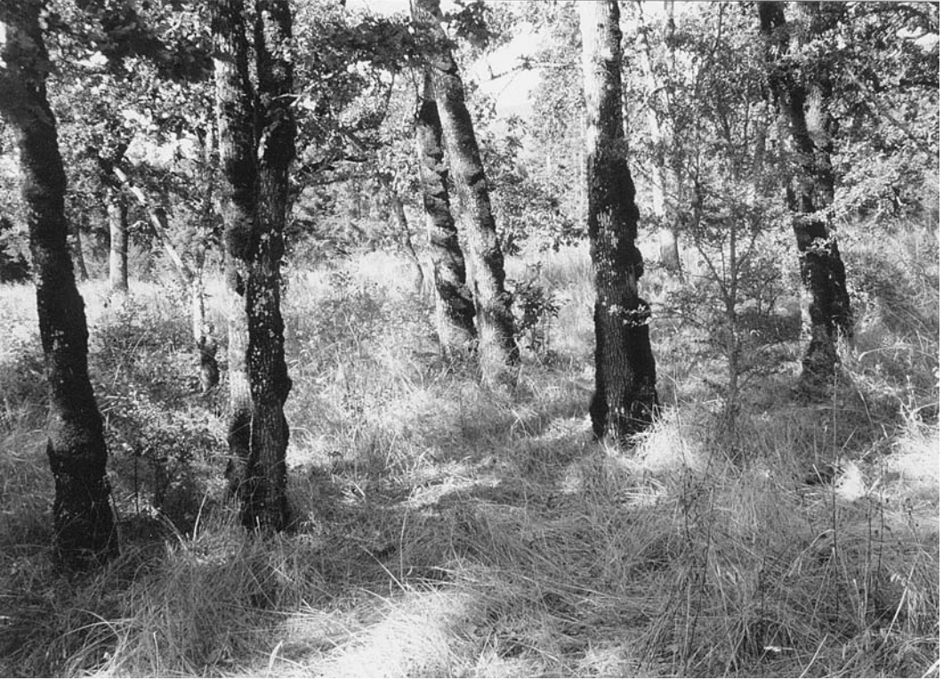
FIGURE 3. Habitat of Triteleia howellii in a Quercus garryana stand in the Cowichan Garry Oak Preserve near Quamichan Lake. Dactylis glomerata is the dominant grass in this late summer photo.

The suppression of fire within the past century may also have contributed to the decrease of Triteleia howellii populations. Most of the sites in which T. howellii has been collected were likely maintained in the past as a result of periodic fires, both natural and unnatural. In the past, aboriginal peoples probably set fire to these stands to maintain them as an important habitat for wildlife (Roemer 1972). Since that time, these sites have experienced little disturbance, resulting in the invasion and expansion of many other species, especially introduced grasses.