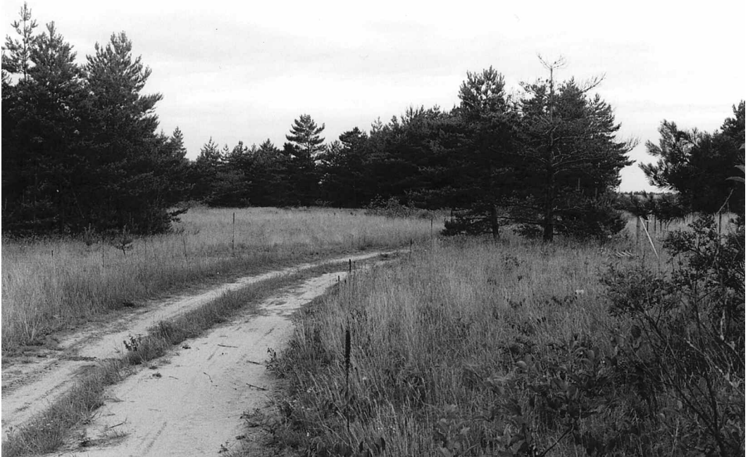
FIGURE 2. Nesting site of Stictiella emarginata at Canadian Forces Base Borden, Simcoe County, Ontario.

continuous pine plains, and periodic fires characterized the area. The coarse loamy sand coupled with ground and crown fires supported large Red Pine and White Pine [ Pinus strobus L.] forests, savanna and barrens (Varga and Schmelefske 1992). Military activity on the Camp Borden Sand Plain in the 20 th century maintained the savanna, barrens and sandy openings (Kurczewski 2000).