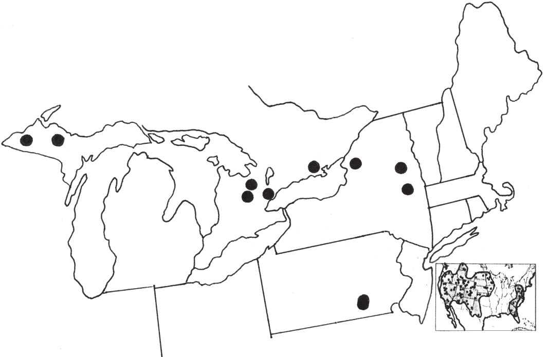
FIGURE 1. Geographic distribution of Stictiella emarginata in the northeastern United States and southeastern Canada. Black circles represent collection localities as follows: MICHIGAN: Ontonagon County, Bruce Crossing; Marquette County, Huron Mountain Club (O'Brien 1989); ONTARIO: Dufferin County, Primrose; Simcoe County, Canadian Forces Base Borden; Regional Municipality of York, Toronto; Hastings County, Sydney Field Station near Foxboro; NEW YORK: Jefferson County, Fort Drum Military Reservation; Saratoga County, South Glens Falls; Albany County, Center [Karner]; PENNSYLVANIA: Cumberland County, Carlisle Junction (Parker 1929). Inset depicts geographic distribution of S. emarginata as illustrated by Bohart and Gillaspay (1985).

Two females were observed nesting at Base Borden in 1996 and 1997 in a sandy two-track running through a Red Pine [ Pinus resinosa Aiton]—Scotch Pine [ Pinus sylvestris L.]—graminoid savanna at the end of an airport runway (Figure 2). This two-track trail was the focal point of our 1998 and 1999 field studies. It was kept open by intermittent military vehicle use. In the early to mid-19 th century droughty Tioga loamy sand (Soil Research Institute of Canada 1959),