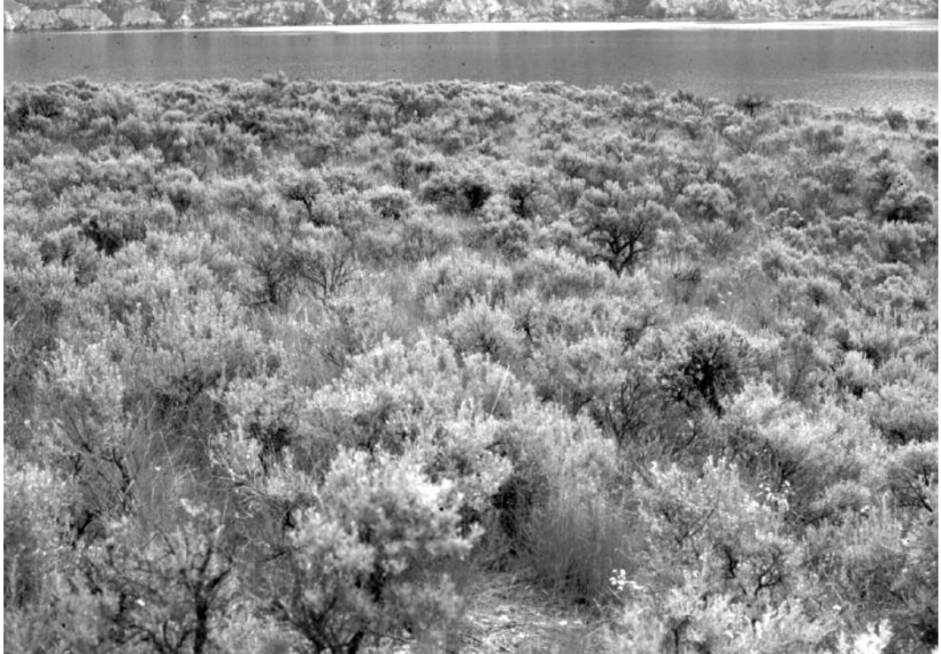
FIGURE 2. Photograph of the sagebrush habitat at Summerland in the Okanagan Valley, south-central British Columbia, Canada.

from the sample of animals captured in each trapping session and then summed for summer periods. Juvenile survival is an index relating recruitment of young into the trappable population to the number of lactating females (Krebs 1966). A modified version of this index is number of juvenile animals at week t divided by the number of lactating females caught in week t - 4 . Mean survival rates (28-day) for summer and winter periods were estimated from the Jolly-Seber model.