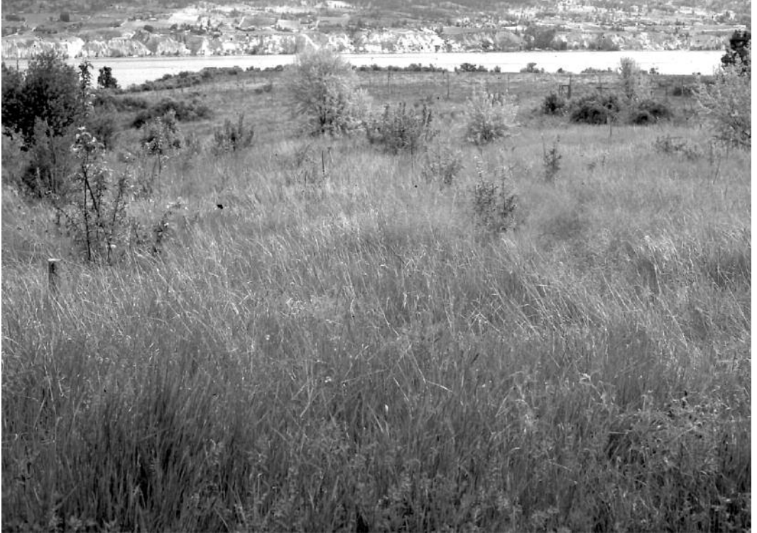
FIGURE 1. Photograph of the old field habitat at Summerland in the Okanagan Valley, south-central British Columbia, Canada.

were set on the afternoon of day 1, checked on the morning and afternoon of day 2 and morning of day 3, and then locked open between trapping sessions.