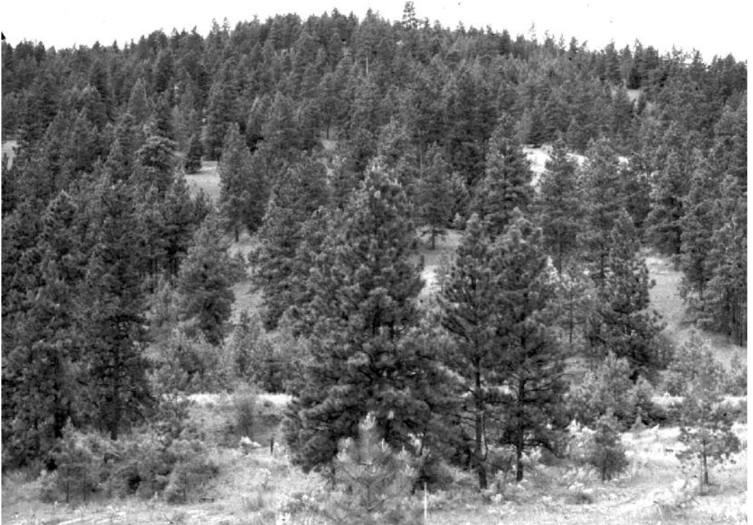
FIGURE 3. Photograph of the Ponderosa Pine forest habitat at Summerland in the Okanagan Valley, south-central British Columbia, Canada.

45.5 animals/ha in sagebrush habitats in 1999, with declining abundance in 2001 and 2002 (Figure 4A). Mean density of Great Basin Pocket Mice per ha was similar ( F_{2,6} = 3.48 , P = 0.10 ) among sites, ranging from lows of 12.0–13.7 to highs of 22.2–28.0 (Table 1). The very low numbers recorded in winter 2002–2003 likely reflect hibernation. Population changes of Great Basin Pocket Mice were very similar between the old field and pine forest habitats (Figure 4A). Highest mean overall density per ha consistently occurred in the sage habitat (19.0) compared with the old field (5.0) or pine forest (5.1) habitats (Figure 4B). This pattern occurred in all years except summer 2001 when the sage and pine forest had statistically similar numbers, based on the significant site \times time interaction. The Great Basin Pocket Mouse was not captured during the winter seasons of sampling owing to hibernation.