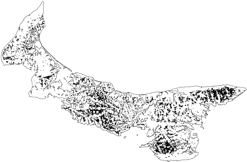
FIGURE 3. The distribution of stands of upland hardwood forest in 1990.

‡ Because it is impossible to distinguish the three native poplar species in aerial photographs ( Populus tremuloides , P. balsamifera , P. grandidentata ) they were grouped as " Populus spp." – however almost all of this is likely to have been P. tremuloides (Trembling Aspen).