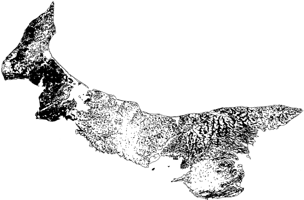
FIGURE 9. The conjectured distribution of wet rich woodland and Black Spruce forest prior to European settlement – based on combining the distribution of stands of these two forest-types in 1990 with the distribution of imperfectly- and poorly-drained soils (excluding stream complexes) as mapped by the Soil Survey of Prince Edward Island (MacDougall et al. 1988).