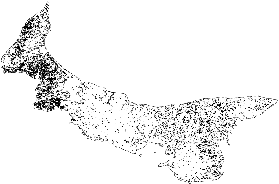
FIGURE 5. The distribution of stands of wet rich woodland in 1990.