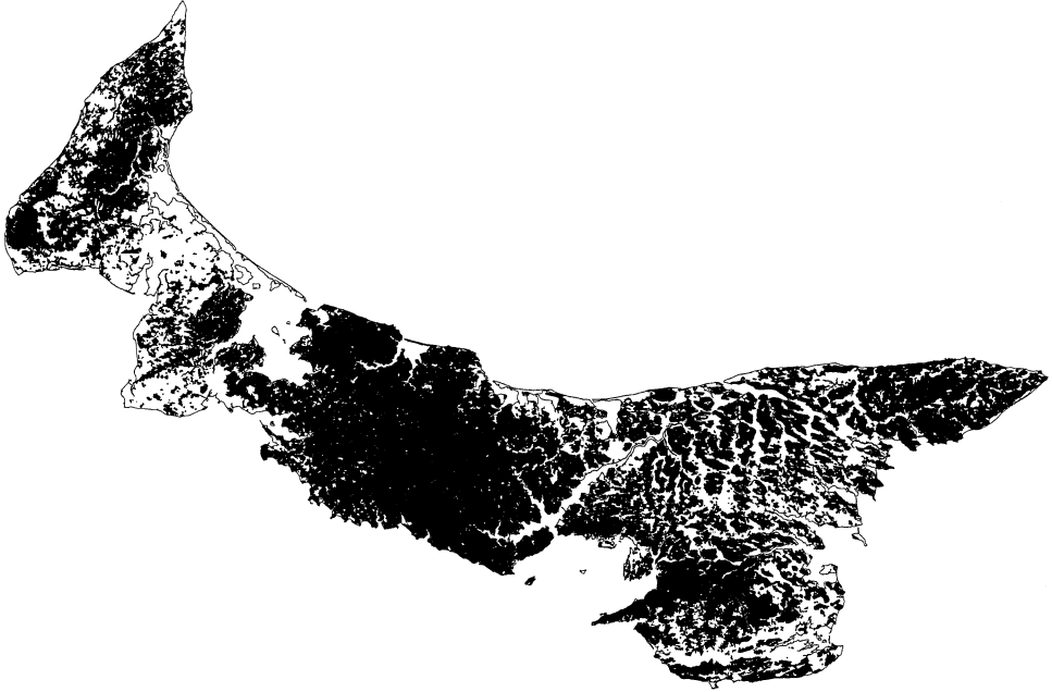
FIGURE 8. The conjectured distribution of upland hardwood forest prior to European settlement – based on combining the distribution of upland hardwood stands in 1990 with that of well-drained soils as mapped by the Soil Survey of Prince Edward Island (MacDougall et al. 1988).