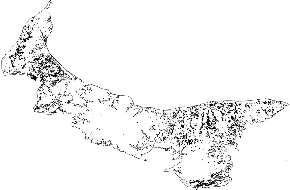
FIGURE 4. The distribution of stands of Black Spruce forest in 1990.