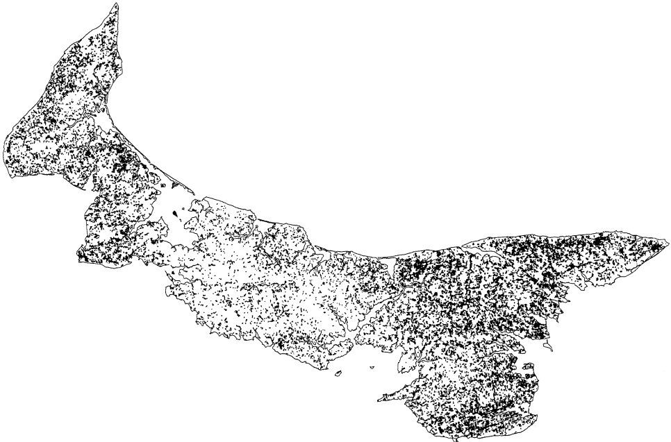
FIGURE 7. The distribution of stands of "disturbed forest" in 1990.