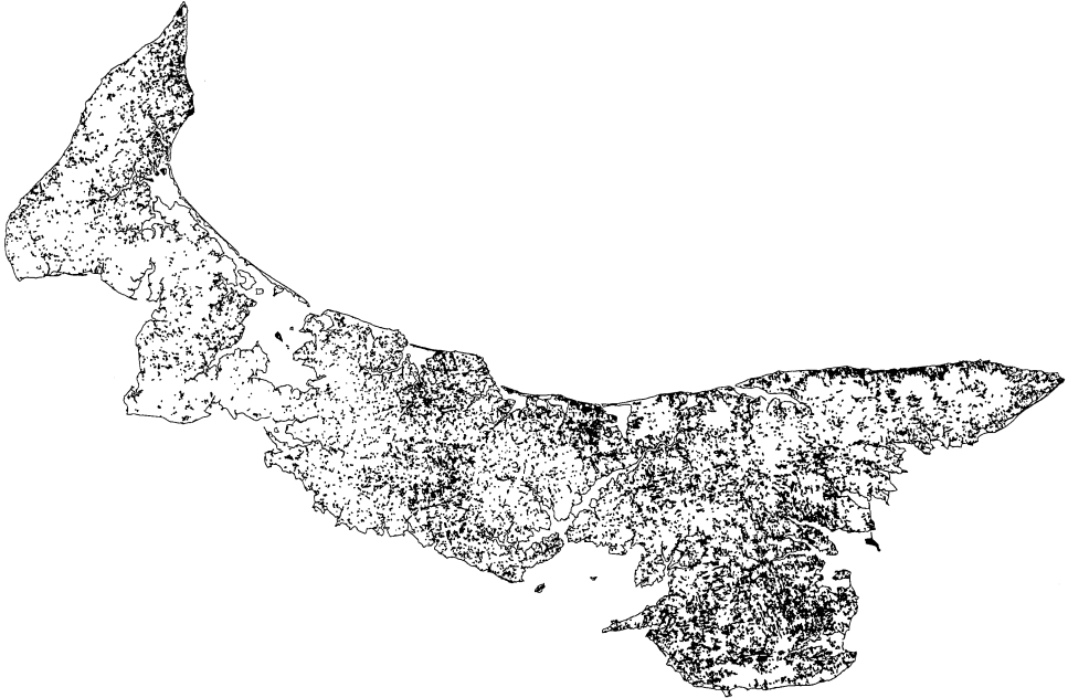
FIGURE 6. The distribution of stands of White Spruce woods in 1990.