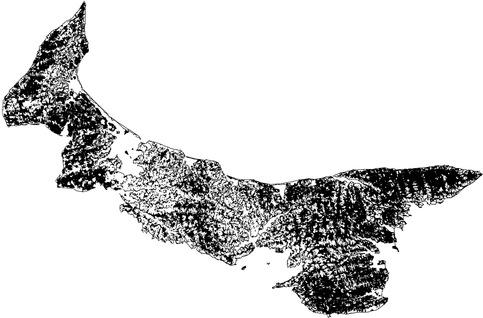
FIGURE 2. The distribution of "high forest", based on photo-interpretation of the 1990 aerial photographic survey of the island. (High forest excludes Speckled Alder woods, plantations, and clear-cut and burned areas.)

tributing greater than 5% crown closure to the canopy, were recorded, with the percentage contribution of each species being estimated to the nearest 10%. The database resulting from the photo-interpretation was computerised, and the stand boundaries were linked to the Geographic Information System (G.I.S.) for the province, enabling the direct plotting onto maps of stand boundaries and areas, as well as the extraction of data on their tree species make-up.