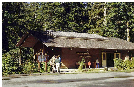
FIGURE 7. Nature House, Miracle Beach Provincial Park, Black Creek, British Columbia, 1960s.