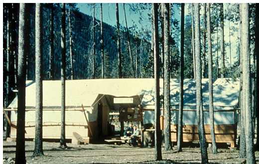
FIGURE 5. The makeshift tent Nature House, Manning Provincial Park, British Columbia.

pretive signs, nature trails, and naturalist talks to most regions of the province.