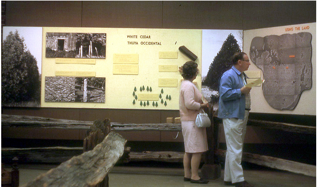
FIGURE 10. Exhibits in Wye Marsh Wildlife Centre, Midland, Ontario, 1970.