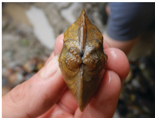
FIGURE S5. Mapleleaf ( Quadrula quadrula ).