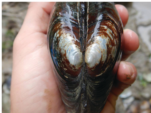
FIGURE S3. Pink Heelsplitter ( Potamilus alatus ).