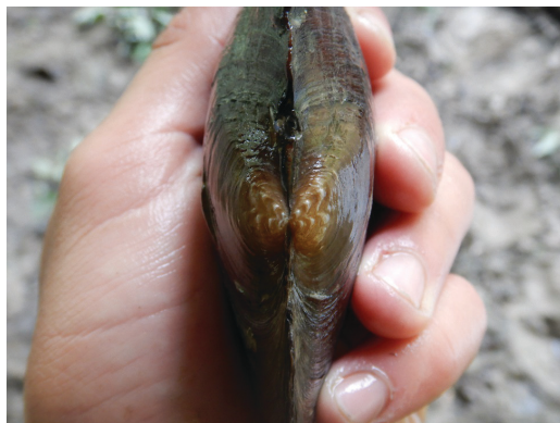
FIGURE S1. White Heelsplitter ( Lasmigona complanata ).