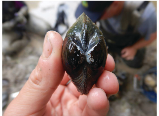
FIGURE S7. Deertoe ( Truncilla truncata ).