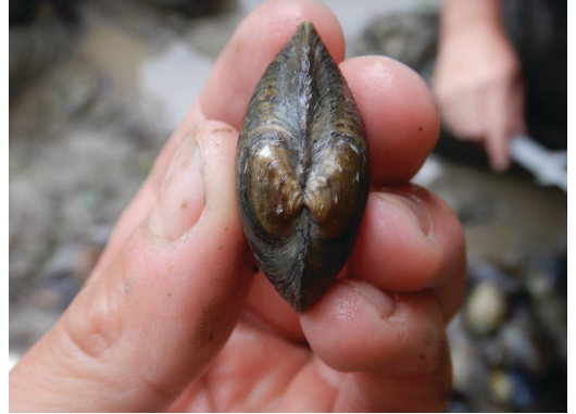
FIGURE S6. Lilliput ( Toxolasma parvum ).