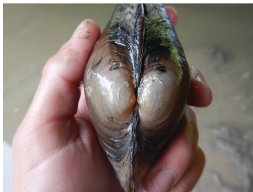
FIGURE S4. Giant Floater ( Pyganodon grandis ).