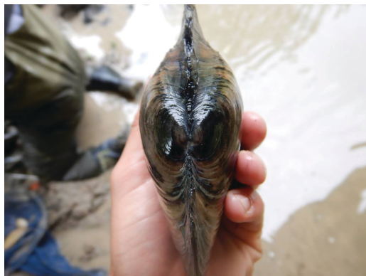
FIGURE S2. Fragile Papershell ( Leptodea fragilis ).