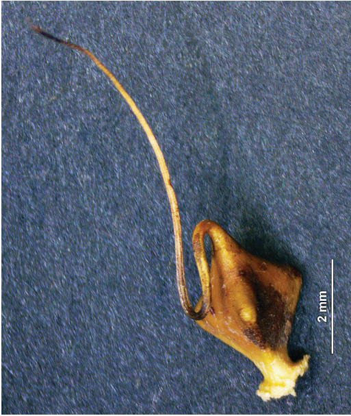
FIGURE 1. Mature False Hop Sedge ( Carex lupuliformis ) achene, from plant material collected in Niagara Region.

described as wet forests, where it prefers canopy openings, as well as riverine wetlands, marshes, and wet thickets on calcareous soil (Thompson and Paris 2004). Ontario sites are typically treed swamps with extensive vernal pooling, characterized by Red Maple ( Acer rubrum L.), Silver Maple ( Acer saccharinum L.), or Green Ash ( Fraxinus pennsylvanica Marshall) growing on clay loam (OMNRF 2017). In Québec, False Hop Sedge is predominantly found growing in canopy openings of Silver Maple swamps (Environment Canada 2014; Langlois and Pellerin 2016). Further south, common associates at sites in Connecticut and Massachusetts include Red Maple, Black Gum ( Nyssa sylvatica Marshall), Green Ash, Swamp White Oak ( Quercus bicolor Willdenow), and Pin Oak ( Quercus palustris Münchhausen) in areas with extensive vernal pooling (Thompson and Paris 2004).