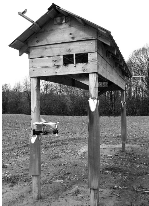
FIGURE 1. One of the nesting structures built to test the impact of conspecific cues on prospecting and nesting by Barn Swallows ( Hirundo rustica erythrogaster ) in southern Ontario, Canada.

structures with similar characteristics to bridges and barns that are used for nesting, including rough vertical surfaces on which birds can build nests, shelter from wind and rain, visual barriers between nests, and a structure large enough to support several nesting pairs (MECP 2013; L. Sarris pers. comm. 13 February 2014; K.R. unpubl. data). We designed a wooden structure with a metal roof, 4.9 m long, 1.3 m wide at the nesting compartments, and 3.7 m tall at the peak of the roof (Figure 1). The structure included 16 nesting compartments, two rows of eight compartments along the 4.9-m length of the structure. In each row of eight compartments, we alternated available nest supports by providing a wooden nest cup (i.e., a wooden replica of a nest) in one compartment and bridging in the shape of the letter X, as found in some old barns, in the next compartment. Each compartment was bordered by 5 \times 25 cm lumber along the center and along the outside of the structure and 5 \times 15 cm lumber between compartments on the inside of the structure to provide a visual barrier between nests. Compartments had a flat ceiling above and no obstructions below. To provide shelter from weather, we added 40 cm of lumber along the outside of the structure below the nesting compartments.