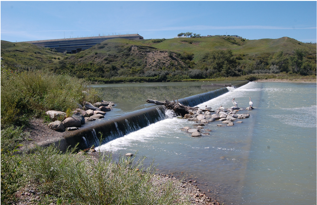
FIGURE 4. The Lethbridge weir across the Oldman River in late summer when flows are low and the recirculation hazard is reduced. American White Pelicans ( Pelecanus erythrorhynchos ) are common, feeding on fish that are blocked by the weir from upstream passage.

Following these observations, we suspect that the hazard to waterfowl varies considerably across weirs and with different river flows. A small weir on a small stream would produce a modest hydraulic recirculation zone that would be less capable of stopping and recirculating ducklings. The hydraulic force and hazard would increase with increasing drop height and stream discharge. The Carseland weir hydraulic system was very loud and this may have signaled its presence from 100 m or more upstream. Waterfowl were abundant in the upstream pond, but remained well away from that drop. With the reduced hazard of smaller weirs and noise cues of larger weirs,