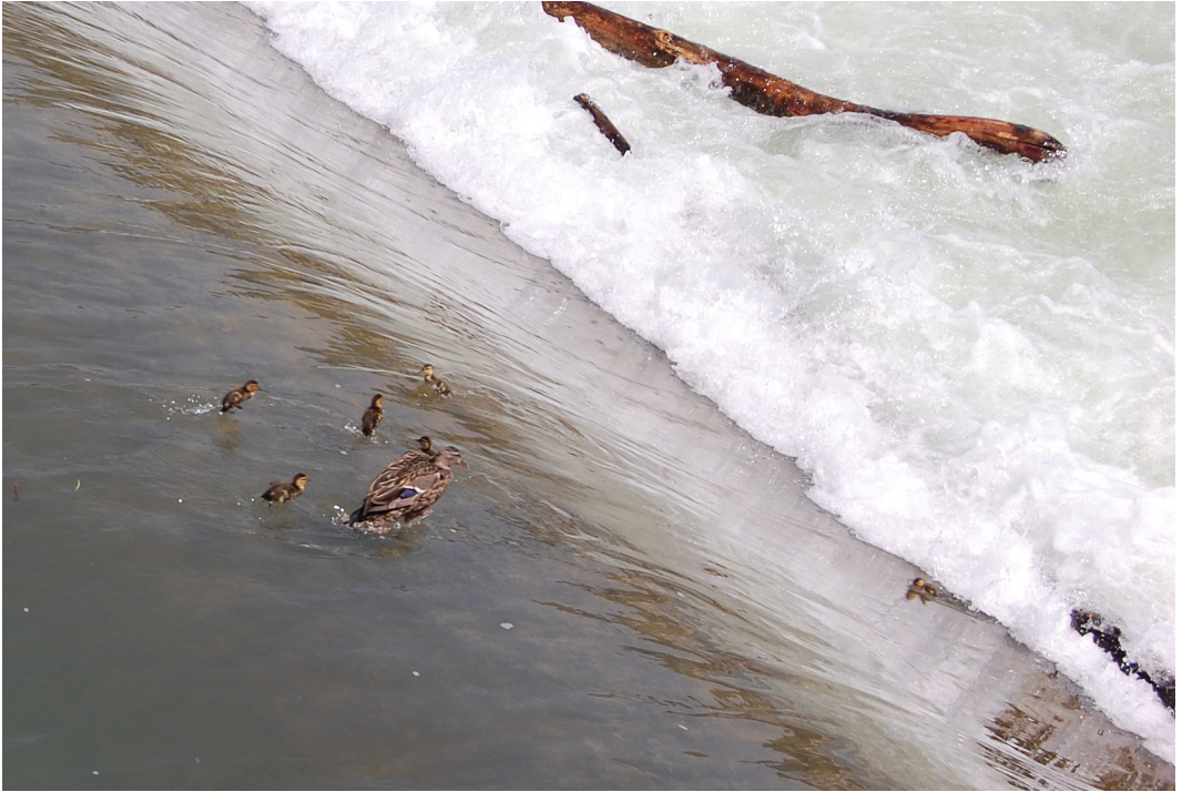
FIGURE 3. A Mallard ( Anas platyrhynchos ) hen with seven ducklings approaching the hydraulic recirculation zone at the Calgary weir, 4 June 2009. Three of these ducklings survived, while four died. The hen is just rising and subsequently flew over the recirculation area.

again plunged under water. With each recirculation, the ducklings appeared to be weakened as they became less vigorous. We observed two ducklings recirculating three times and one four times, but did not observe the fourth over the next few minutes. After about five more minutes, one duckling emerging in the water downstream from the hydraulic recirculation area, drifting passively on its side, apparently dead. We observed no further evidence of the remaining three ducklings over an additional 30 min.