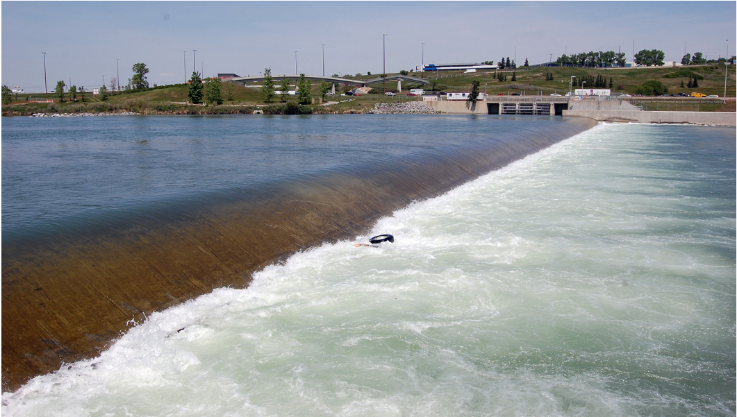
FIGURE 1. The Calgary weir in June 2009 (discharge 109 \text{ m}^3/\text{s} ), displaying the river water flowing over the weir and into the hazardous hydraulic recirculation zone, with trapped sticks and a wheel. The structure on the far side allows offstream diversion into an irrigation canal. This system was subsequently modified with the Harvie Passage to produce safer paddling channels.