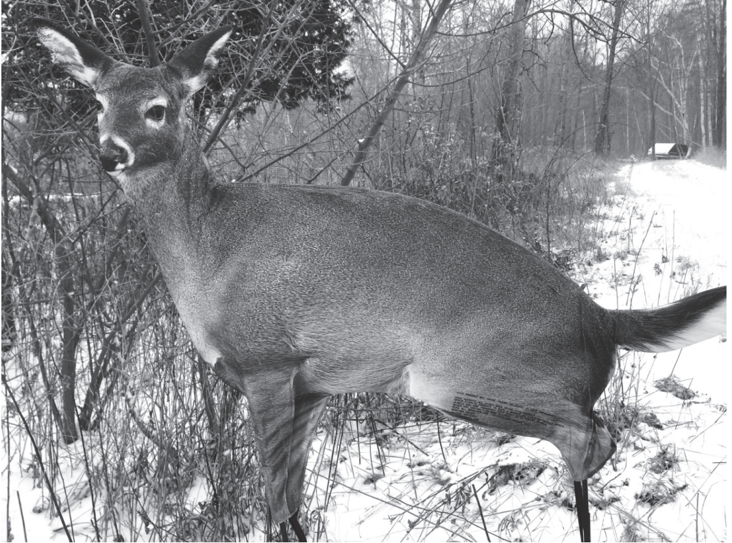
FIGURE 1. Life-like decoy of a White-tailed Deer ( Odocoileus virginianus ) that was attacked by a wolf ( Canis sp.) 2 km west of Killarney Provincial Park, Ontario, Canada, during the first week of November 2017.

water; this channel surrounds McGregor Island. The maple forest that the stand overlooked had minimal understorey for about 150 m before transitioning to marshy lowland, which abutted a small shallow cove that was connected to the main water channel. D.P.G. accessed the stand by parking his boat at the north-western opening of this cove (~300 m east by north-east of the stand). There was no snow cover during this period.