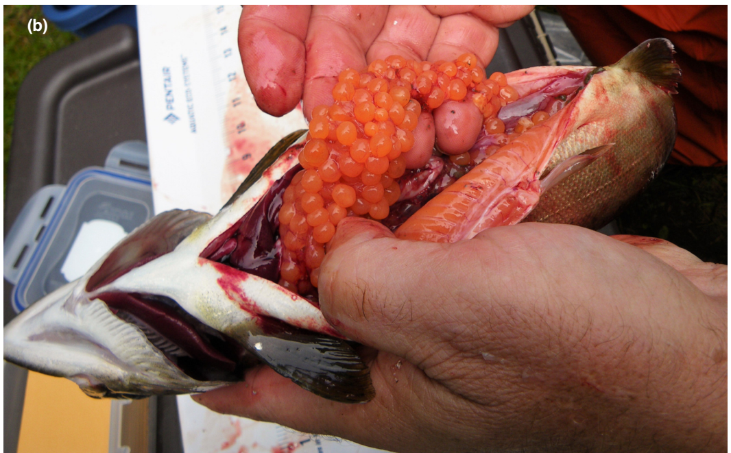
FIGURE 2. Image of (a) mature male and female Coho Salmon ( Oncorhynchus kisutch ), and (b) a single mature female Coho Salmon from West Lake, British Columbia, Canada. In the top image the middle fish is a mature male, the top and the bottom fishes are immature females. The measuring board is 30 cm long.