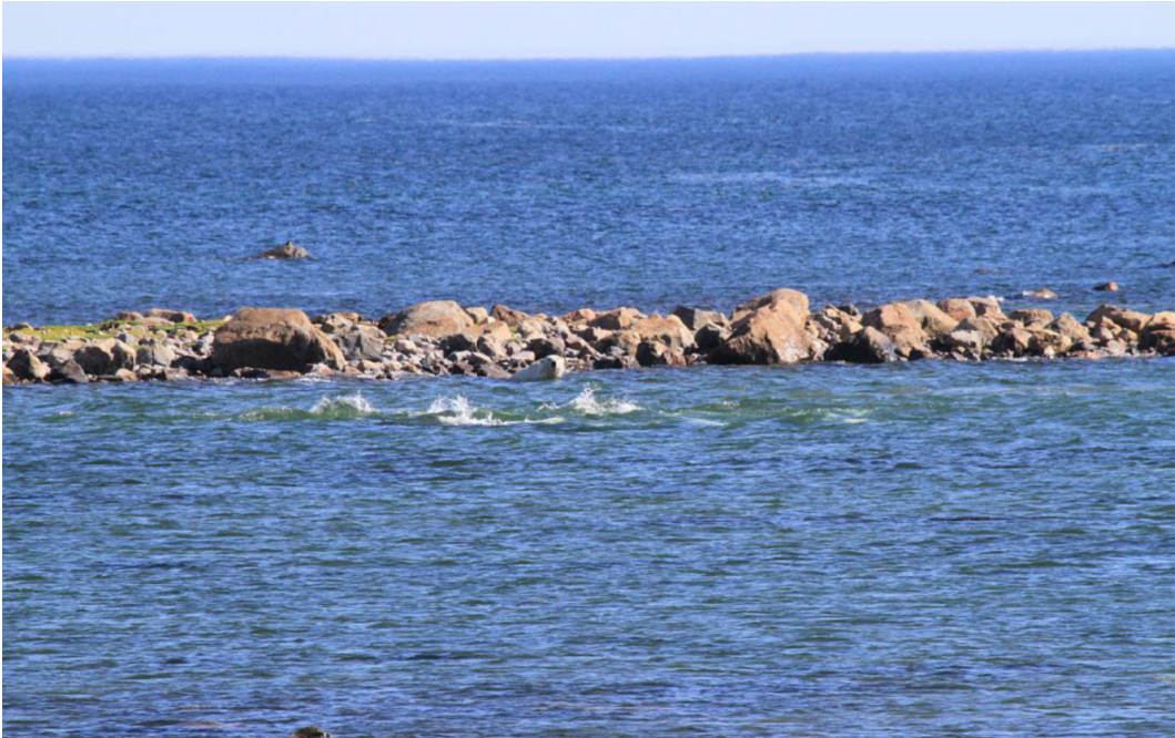
FIGURE 1. A Polar Bear ( Ursus maritimus ) looks on as Belugas ( Delphinapterus leucas ) clump together near shore in less than 2 m of water during a Killer Whale ( Orcinus orca ) attack near the mouth of the Seal River, Hudson Bay.

During the attack, Belugas were observed moving quickly, porpoising, thrashing in the water, and clumping together close to shore in < 2 m of water (Figure 1) as they moved southward along the coast. On the day following the attack, few Belugas were observed near the southern outflow of the Seal River, a location where they are typically seen in high numbers at this time of