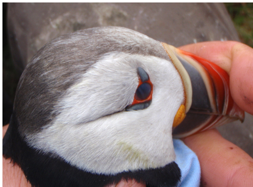
FIGURE 4. Atlantic Puffin on Gull Island, Newfoundland, showing a likely somatic mutation, as other dark plumage appeared normal.

2 bill grooves (Harris 1981), and all other aspects of plumage and colouration of bare parts were typical, including the black feathers on the back and proximal region of the breast. Although this might appear to be a case of dilution, the genetic mechanism (a heritable mutation affecting the number of pigment molecules, but not their colour) would result in all black plumage appearing grey. Therefore, this is likely the result of a somatic mutation, rather than a heritable plumage abnormality.