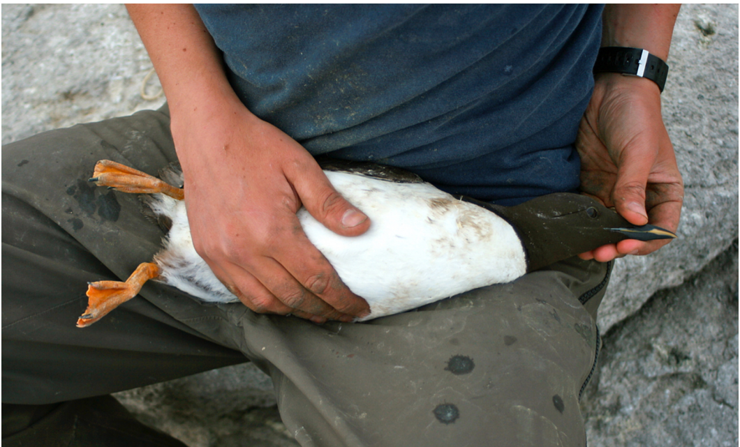
FIGURE 3. Common Murre on Cabot Island, Newfoundland, showing progressive greying in the legs and bill.