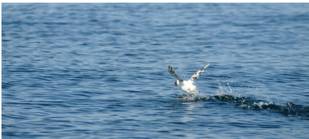
FIGURE 6. A “white puffin” in the Grand Manan basin, New Brunswick, in 2009, showing an extreme case of progressive greying.

In 2002, 2004, and 2009, a “white puffin” was observed at sea around Machias Seal Island or in the Grand Manan basin (Figure 6). The bare parts were unaffected, as were portions of the feathers (e.g., tips of primary feathers), making this an extreme case of progressive greying. Other “white puffins” have been recorded at the Isles of Scilly, United Kingdom, in May 2009 (Harris and Wanless 2011) and at the Faroe Islands in the late 1800s (Lockley 1953; see below).