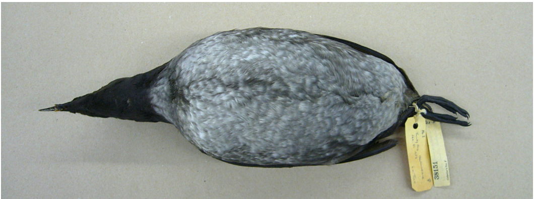
FIGURE 2. Melanistic Thick-billed Murre (CMNAV 38151).