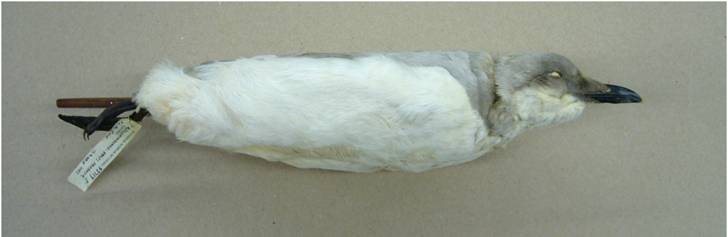
FIGURE 1. Thick-billed Murre (CMNAV 37719) showing dilution.