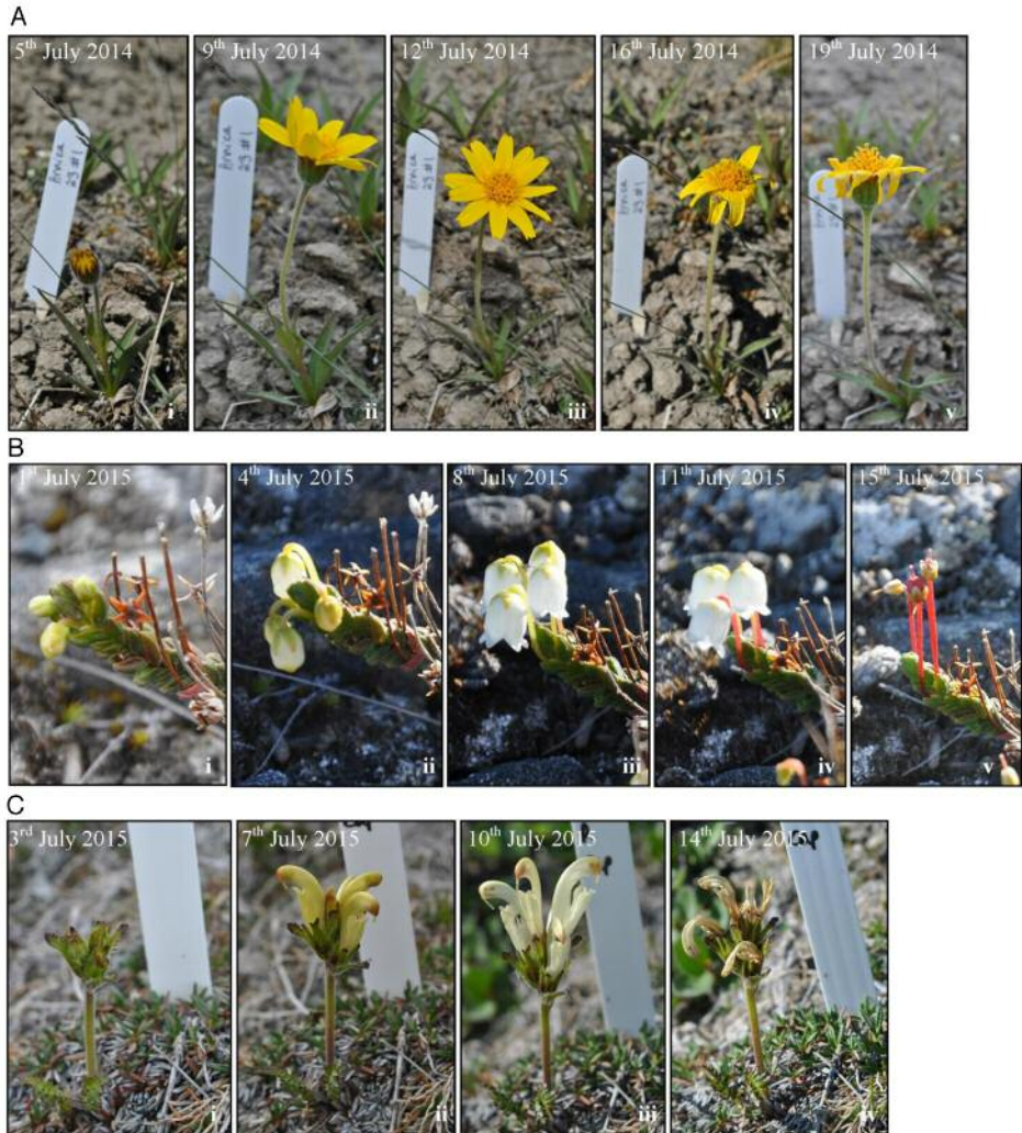
FIGURE 1. Flower progression of (A) Arnica angustifolia (Narrow-leaved Arnica) (B) Cassiope tetragona (Arctic White Heather) and (C) Pedicularis capitata (Capitate Lousewort) at Lake Hazen, Quttinirpaaq National Park, Ellesmere Island, Nunavut, Canada, showing flower(s) in bud (Ai, Bi and ii, and Ci), open flowers (Aii and iii, Biii and iv, and Cii and iii) and finish of flowering (Aiv and v, Bv and Civ).

The flowering progression of three species, A. angustifolia , C. tetragona and Pedicularis capitata Adams (Capitate Lousewort; Kukiujait [Aiken et al. 2007]; Orobanchaceae), was monitored at Lake Hazen, Quttinirpaaq National Park, from 13 th June to 31 st July in 2013, 2014 and 2015 (Figure 1). A population of