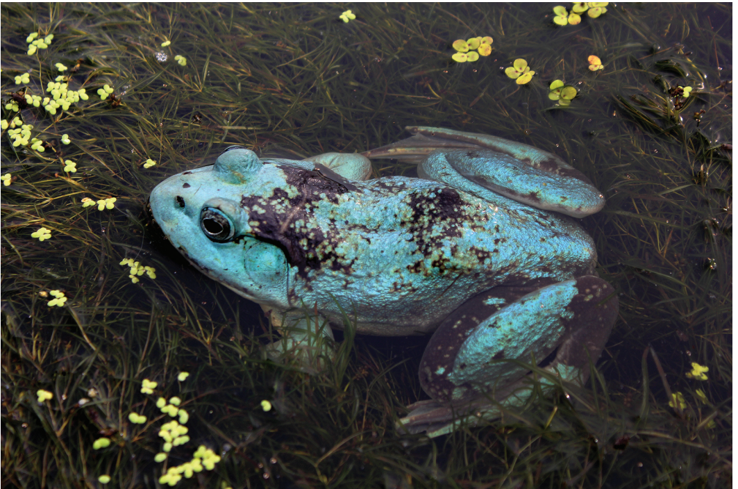
FIGURE 4. Third record of a blue American Bullfrog, Lithobates catesbeianus , an adult female, captured in dug pond, Route 6, Wallace Bay area, Cumberland County, Nova Scotia, 45°48'50"N, 63°33'30"W, on 4 August 2014.