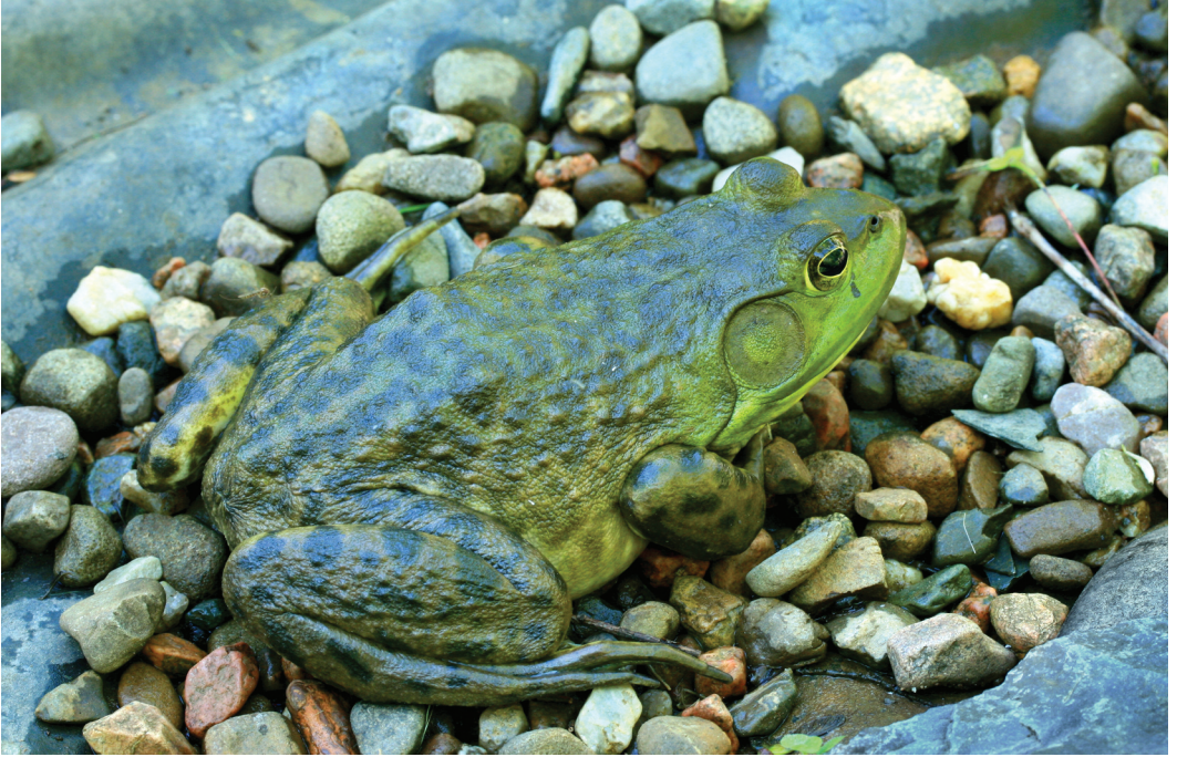
FIGURE 3. Second record of a blue American Bullfrog, Lithobates catesbeianus , an adult male, photographed at the edge of Cooks Lake, Halifax County, Nova Scotia, 45°00'20"N, 63°15'00"W, on 15 June 2007.