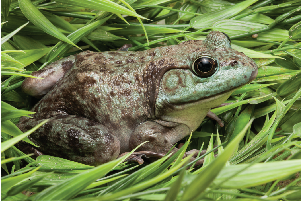
FIGURE 5. American Bullfrog from the Wallace Bay area, Nova Scotia, photographed in captivity under artificial light. The blue parts look metallic greyish green and the black blotches look brownish black. Figure 4 shows the same bullfrog photographed in sunlight.