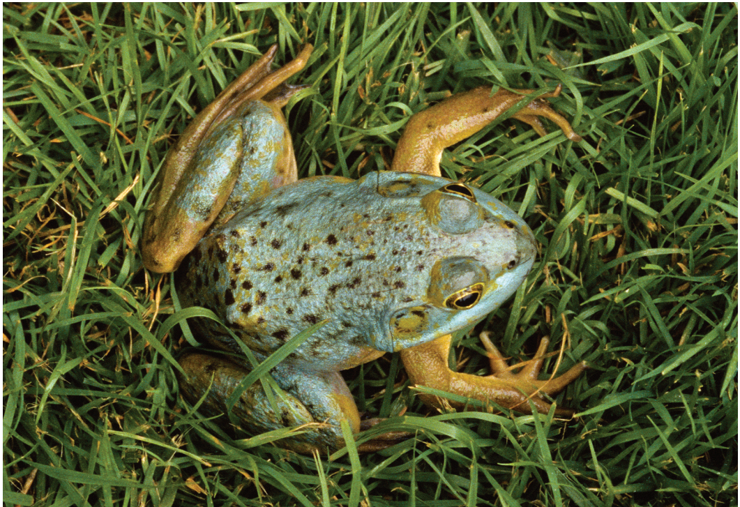
FIGURE 2. First record of a blue American Bullfrog, Lithobates catesbeianus , an adult female, photographed at Charleston on the Medway River, Queens County, Nova Scotia, 44°10'00"N, 64°39'30"W, on 26 July 1980.

In natural habitat and sunlight, these frogs appear powder blue in colour to the human observer, with some brownish-black spotting, and, in the case of the Wallace Bay individual, black patches. However, in captivity, the Wallace Bay bullfrog was observed to be a metallic greyish-green colour (Figure 5). These observed colour changes could be due to changes in the quality of ambient light, from natural sun to fluorescent laboratory illumination, or to physiological colour change involving pigment translocation within the DCU. Dispersion of melanin throughout melanophores can reduce light scattering by the iridophore layer and darken the skin, causing previously light blue frogs to appear much darker. The process of physiological colour change is under hormonal control, where low concentrations of melatonin activate the Mel 1c receptor, resulting in movement of melanin granules toward the centre of the cell, lightening skin colour (Sugden et al. 2004).