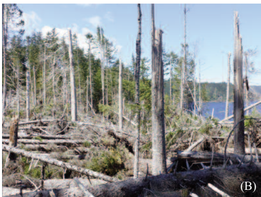
FIGURE 2. A section of the forest on East Limestone Island, Haida Gwaii, British Columbia, (A) before the storm in winter 2010–2011 and (B) after the storm.

about half the island, mainly in an arc along the east and north coasts extending inland up to 300 m (Figure 1). In 2006, the Ancient Murrelet population was estimated at 506 breeding pairs (Lemon 2007).