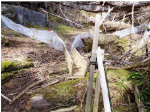
FIGURE 3. Set up for recording, showing a motion-detector camera, plastic funnel fences, and an exit trough.

The time at which chicks were photographed was compared with the time of capture of chicks in funnels 1–4 in earlier years, using the period 1996–2003, during which the population was relatively stable after a period of population decline caused by Raccoon ( Procyon lotor ) predation (Gaston and Descamps 2011) and before another period of decline after 2003. All times are given in Pacific Daylight Time (GMT + 9 h). Changes in numbers of chicks recorded between 2013 and 2014 at the reconstructed funnels 3 and 4 were compared with numbers recorded at funnels 5 and 6, where the catchment area was less affected by fallen trees (Figure 1).