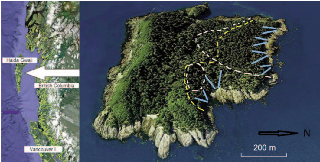
FIGURE 1. Aerial view of East Limestone Island, Haida Gwaii, British Columbia, seen from the east. The area of the blowdown is enclosed by white dashes, the Ancient Murrelet ( Synthliboramphus antiquus ) breeding area is north and east of the yellow dashes, and the original chick funnels are shown in blue. Left inset map shows the position of East Limestone Island on the coast of British Columbia. Images from Google Earth, data SIO, NOAA, US Navy, NGA, GEBCO ©2015 Cnes/Spot image. Image ©2015 DigitalGlobe.