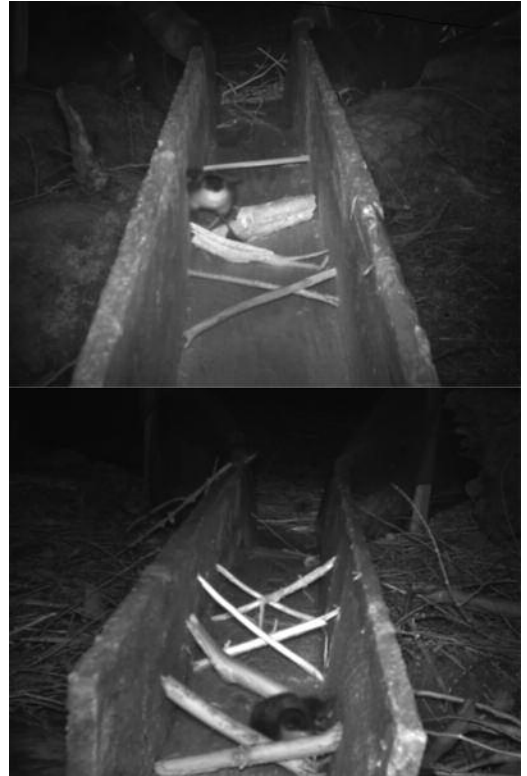
FIGURE 4. Two Ancient Murrelet ( Synthliboramphus antiquus ) chicks making their way through an exit trough. Twigs were placed across the troughs to slow the chicks and ensure that they were captured on camera. Photographs of adult murrelets, deer mice, and deer were also recorded by the cameras.