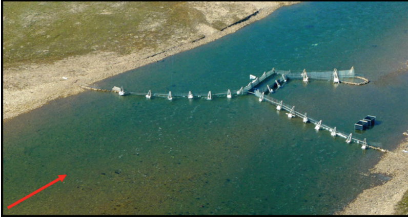
FIGURE 2. Aerial view of the weir across the Halokvik River, Victoria Island, Nunavut, used in 2013 as part of an Arctic Char ( Salvelinus alpinus ) population assessment. The red arrow indicates the upstream direction of migration.