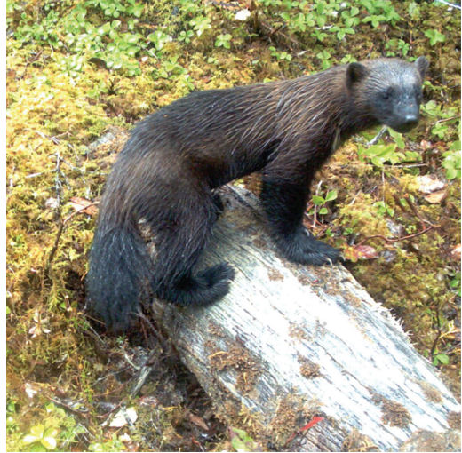
FIGURE 3. Wolverine ( Gulo gulo ) no. 2, photographed September 6, 2011 at station no. 2 near the shoreline of the east side of Chapple Inlet, Princess Royal Island, British Columbia.

larger than individual no. 2. Hair snag samples using whole hairs of approximately the same length from these two individuals were analyzed for isotopic signatures.