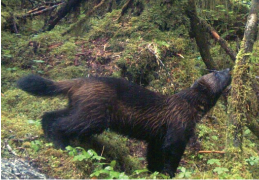
FIGURE 2. Wolverine ( Gulo gulo ) no. 1, photographed August 13, 2011 at station no. 5 near Douglas Creek on Princess Royal Island, British Columbia.