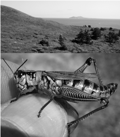
FIGURE 4. Melanoplus madeleineae . Above, open meadow habitat on Île du Havre aux Maisons in the Îles-de-la-Madeleine, Quebec, with Île d'Entrée in the background on 11 August 2010. Below, female Melanoplus madeleineae on 11 August 2010.

Vickery and Kevan (1985) map a single record for this species, from northwestern New Brunswick in the Kent–Northumberland counties border region. Historical collections in the New Brunswick Museum and the Canadian National Collection of Insects and a recent collection from the Caledonia Gorge Protected Natural Area add Restigouche County, Saint John County, and Albert County, together suggesting a wide distribution in the province.