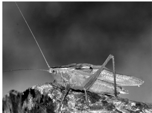
FIGURE 2. Orchelimum gladiator , Callendars Beach, Kouchibouguac National Park of Canada, Kent County, New Brunswick, netted by Park visitor A. Martin on 18 July 2012 during a public “bioblitz” organized by the Park.