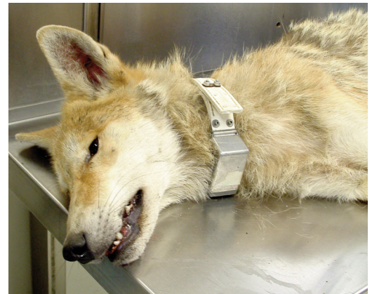
FIGURE 3B. Wild northeastern Coyote/Coywolf ( Canis latrans \times C. lycaon ) from Cape Cod, Massachusetts, showing reddish-yellow coloration and white face. Photo: J. Way, January 20, 2004, Barnstable, Massachusetts.