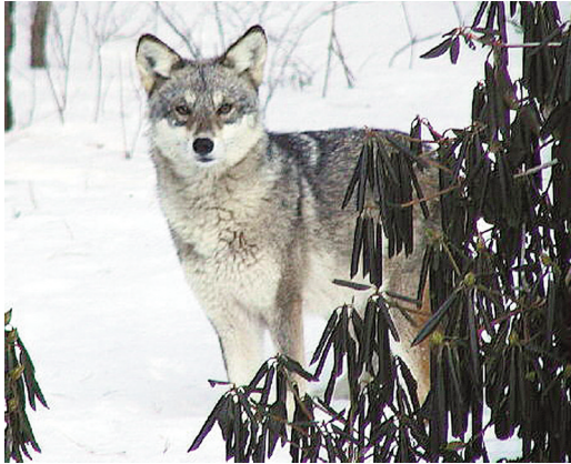
FIGURE 3C. Wild northeastern Coyote/Coywolf ( Canis latrans × C. lycaon ) from Cape Cod, Massachusetts, showing dark gray coloration and whitish face. Photo: Anne Middleton, 2004, Dennis, Massachusetts.