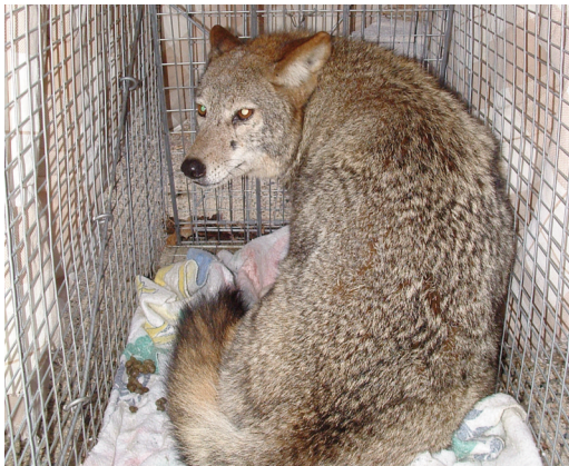
FIGURE 3A. Wild northeastern Coyote/Coywolf ( Canis latrans \times C. lycaon ) from Cape Cod, Massachusetts, showing grizzled-gray coloration and whitish face. January 9, 2008, Barnstable, Massachusetts.

Qualitatively, northeastern Coyotes appeared more wolf-like than Coyote-like. The appearance of 50 individual northeastern Coyotes captured in Massachusetts was as follows: white-faced animals ( n = 10 ); dark brown and grizzled gray animals ( n = 13 ) often described as being like a German Shepherd; light brown and blondish ( n = 5 ), red ( n = 2 ); or dull gray animals ( n = 5 ) (Figures 3A, 3B, 3C, and 3D).