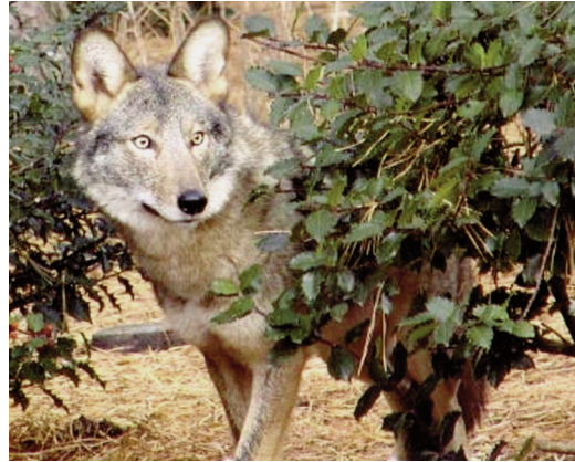
FIGURE 3D. Wild northeastern Coyote/Coywolf ( Canis latrans × C. lycaon ) from Cape Cod, Massachusetts, showing a robust German Shepard-like appearance. Photo: Anne Middleton, 2004, Dennis, Massachusetts.