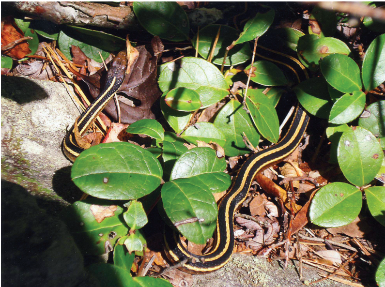
FIGURE 1. Northern Ribbonsnake, Thamnophis sauritus septentrionalis , from Minamkeak Lake, Lunenburg County, Nova Scotia. 15 August 2011.

Scotia (44°16.256'N, 64°33.299'W). A picture was taken by cell phone and is on file at the Nova Scotia Museum of Natural History. Both localities are within the Petite Rivière watershed, which has been added to the range of the Eastern Ribbonsnake in Nova Scotia (Figure 2). The Italy Cross record represents the only January sighting of the Eastern Ribbonsnake in Nova Scotia.