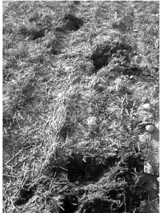
FIGURE 2. The adult female American Badger ( Taxidea taxus ) equipped with the radio-transmitter dug out a series of small, shallow holes while zigzagging along the fence line.

Sinuous hunting movements have been reported in the past for the Ermine ( Mustela erminea ) (Powell