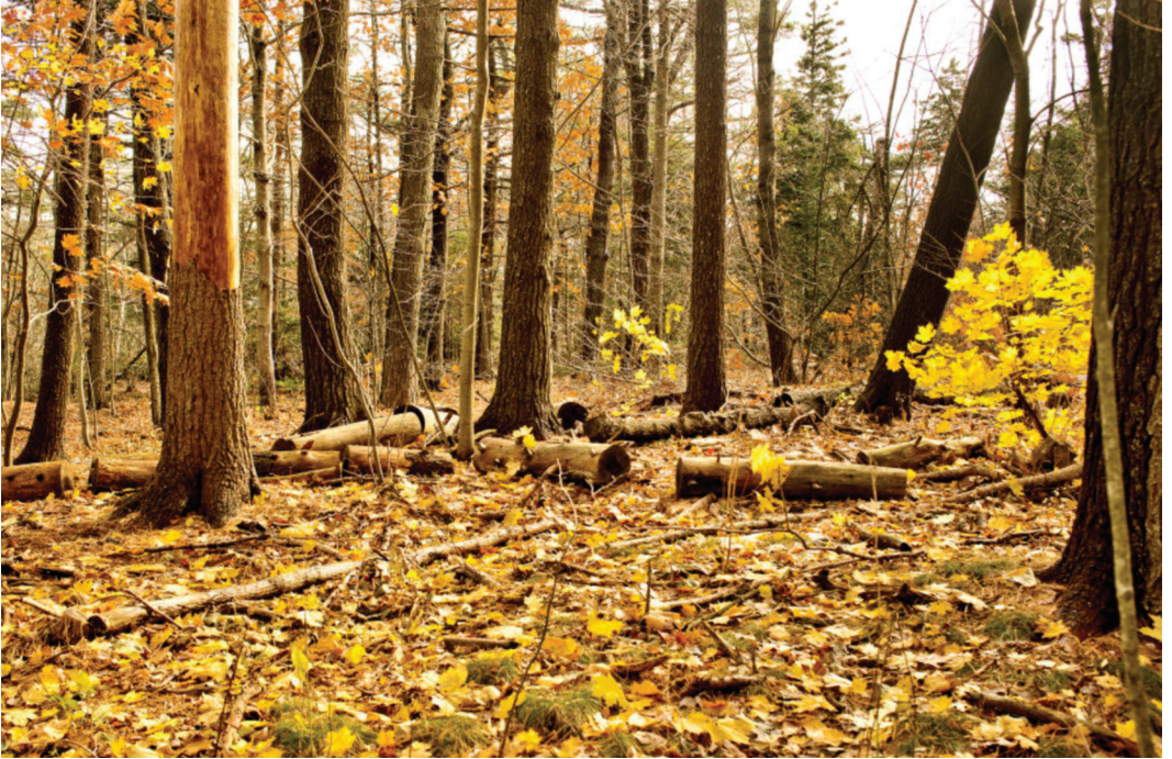
FIGURE 2. Habitat where a variant of the amelanistic condition of the Eastern Red-backed Salamander, Plethodon cinereus , was discovered in Point Pleasant Park, Halifax, Nova Scotia.