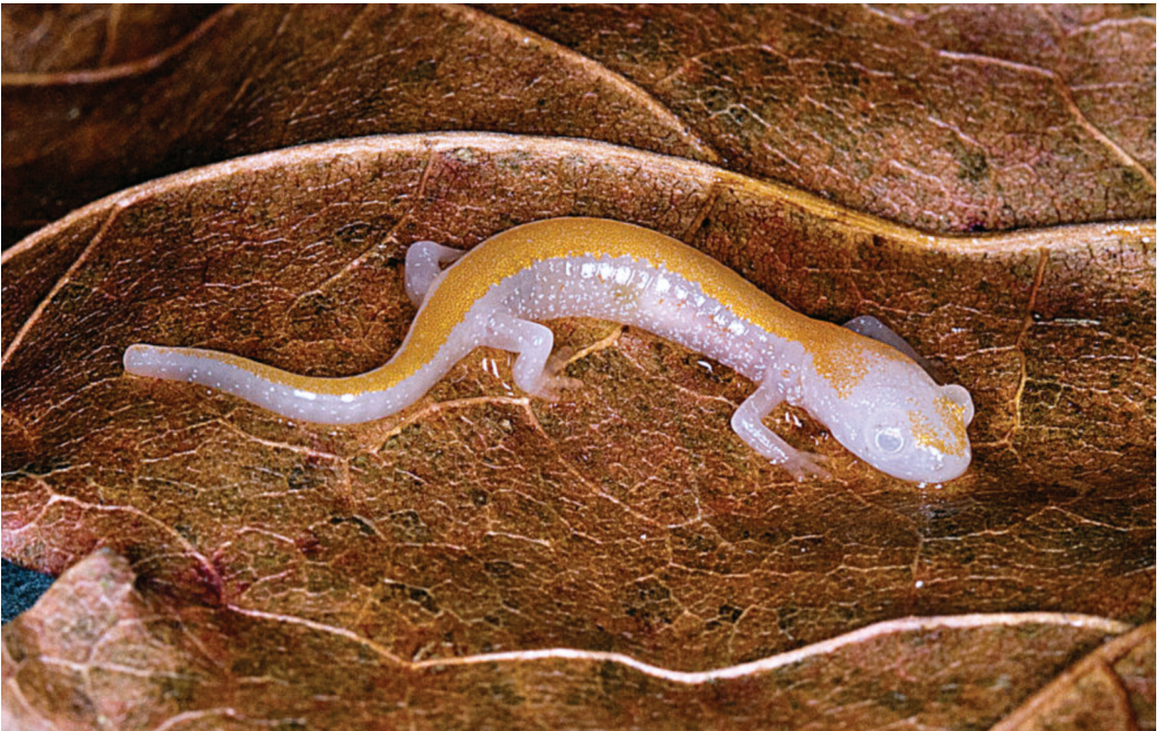
FIGURE 3. Dorsal-lateral view of a variant of the amelanistic condition of the Eastern Red-backed Salamander, Plethodon cinereus , from Point Pleasant Park, Halifax, Nova Scotia.