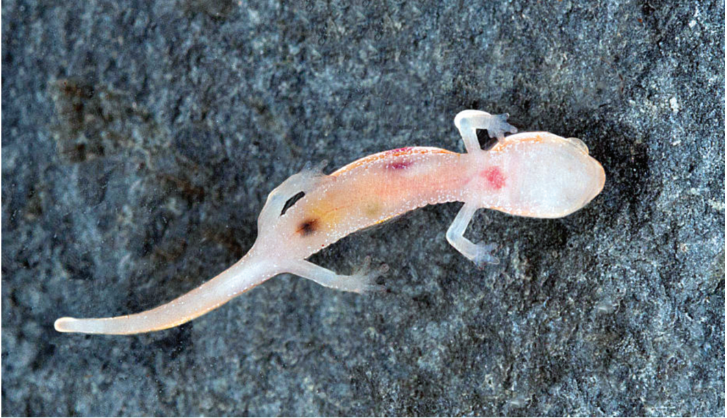
FIGURE 4. Ventral view of a variant of the amelanistic condition of the Eastern Red-backed Salamander, Plethodon cinereus , from Point Pleasant Park, Halifax, Nova Scotia.

in a small, isolated population. This could also be a chance observation of a rare event.