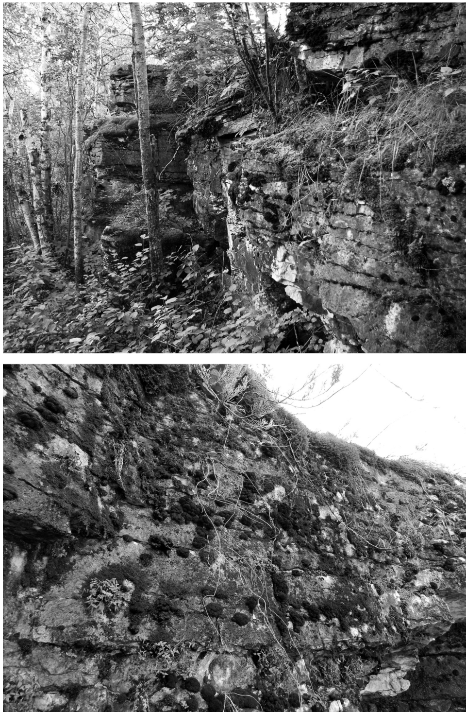
FIGURE 2. Marble Ridge. In both photographs, the escarpment is facing approximately east. Top: portion of the escarpment with a canopy cover of Trembling Aspen and Paper Birch. Bottom: a mesic rock face supporting numerous large colonies of the uncommon moss Grimmia teretinervis .