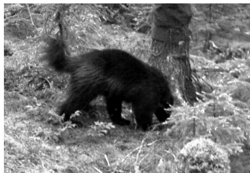
FIGURE 1G. Photograph of a Wolverine in the Red Lake area, northern Ontario, July 8, 2009.

A significant number of photographs of White-tailed Deer, Raccoons, and Coyotes were acquired in southern Ontario; however, one should not infer from these data that these three species exist in high densities. Nevertheless, one can infer a significant presence of those species based on the sheer magnitude of the photographs. In some instances during this study, there were four or five different individuals of the same species in a single photograph at several camera locations spaced several home ranges apart in southern Ontario (e.g., this was true for White-tailed Deer, Raccoons, and Coyotes). This is indicative of a significant presence