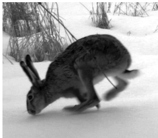
FIGURE 1D. Photograph of a European Hare in the Cannington area, southern Ontario, December 20, 2009.

tions of the North American Elk, which was restored to northern Ontario during 2000 and 2001, as described by Rosatte et al. (2007).