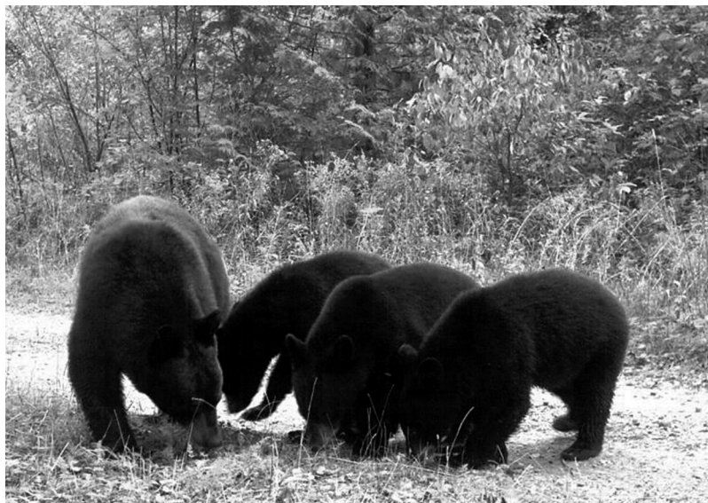
FIGURE 1A. Photograph of American Black Bears on a snowmobile trail near Sunderland, southern Ontario, September 26, 2008.

memory cards being replaced at that time. The memory cards were viewed using the trail camera or via a computer, photographs of mammals were verified to species by biologists and wildlife technicians, and the data (date the photograph was taken, location of the camera, and species) were tabulated in Microsoft Excel spreadsheets. I received the data files annually during the study. Where multiple photographs of the same animal had been taken in succession (e.g., the RECONYX cameras took five photographs in 5 sec), the animal was counted only once. However, if multiple animals of the same species were captured in a single photograph, the total number of animals present was counted.