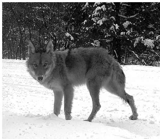
FIGURE 1C. Photograph of a Coyote in the Lindsay area, southern Ontario, January 6, 2010.