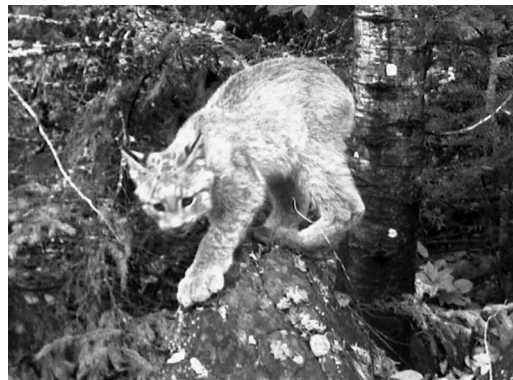
FIGURE 1F. Photograph of a Canada Lynx in the Red Lake area, northern Ontario, September 1, 2009.

( n = 481 ), White-tailed Deer ( n = 183 ), Red Fox ( n = 72 ), Striped Skunk ( n = 39 ), American Black Bear ( n = 38 ), European Hare ( n = 23 ), Eastern Gray Squirrel ( n = 23 ), and Fisher ( n = 10 ) (Figure 2). Six other species that were photographed using snowmobile trails are noted in Figure 2.