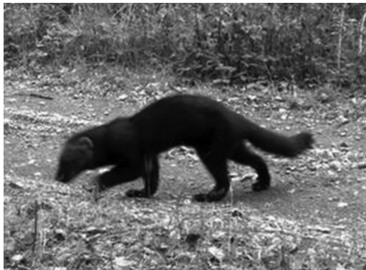
FIGURE 1E. Photograph of a Fisher in the Sunderland area, southern Ontario, August 23, 2009.