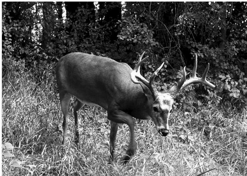
FIGURE 1B. Photograph of a male White-tailed Deer in the Peterborough area, southern Ontario, September 9, 2010.