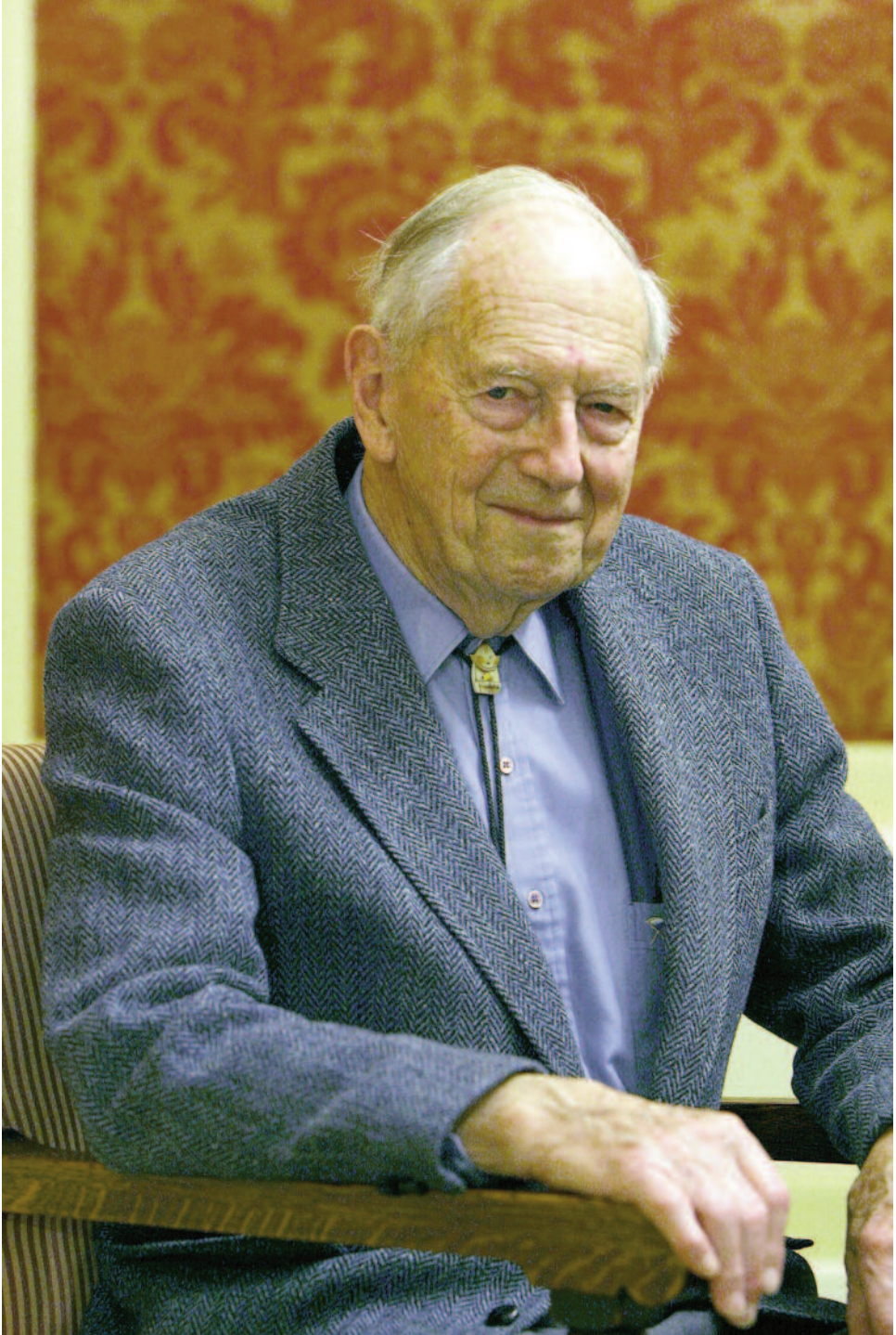
FIGURE 1. Ian McTaggart Cowan, October 2004 as Director Emeritus of the Nature Trust of British Columbia.