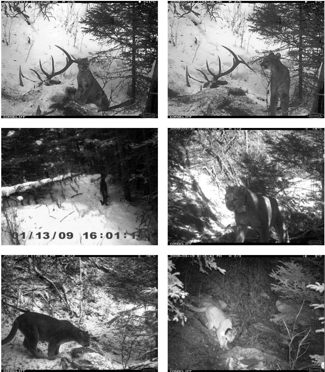
FIGURE 2 a-f. Six individual Cougars can be identified visiting and/or scavenging on the elk carcass between January 7-April 17 2009.

Elk and Moose by her as well. She was first photographed at the carcass on 2 April 2009 and ate throughout that day and the next, despite the fact that little meat remained on the carcass. She left the carcass frequently and covered it when she left between scavenging events. The camera's memory card filled on 3 April 2009, but GPS data from her radiocollar showed that she remained at the carcass until the morning of 8 April 2009 (M. Bacon and M. Boyce, unpublished data). She