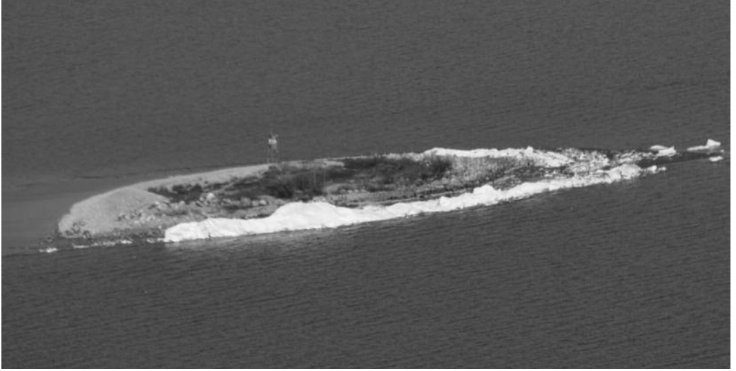
FIGURE 2. Aerial view of Egg Island, Lake Athabasca, 14 June 2009.