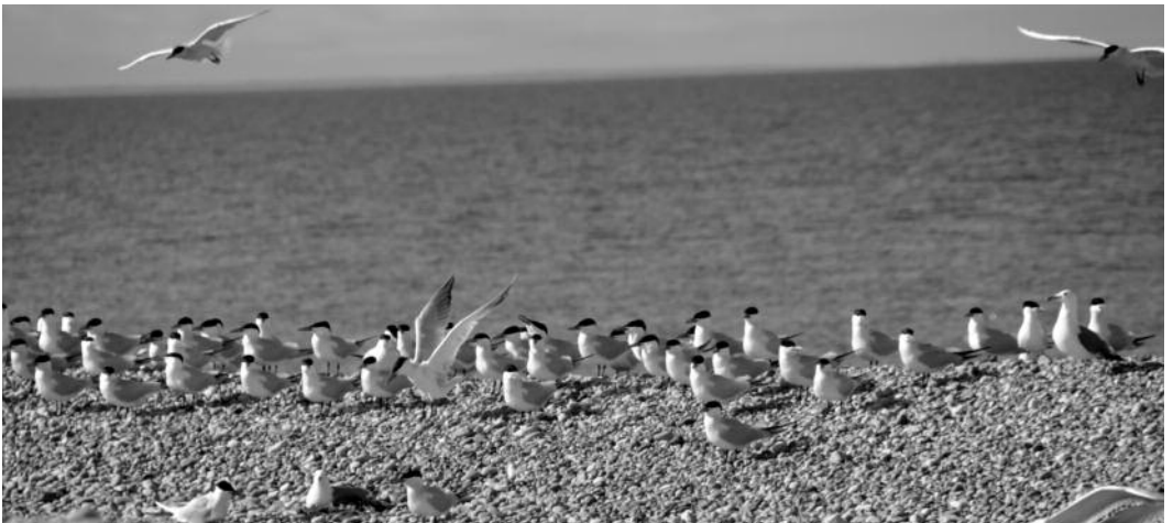
FIGURE 3. Approximately one-third of the Caspian Terns breeding on Egg Island, Lake Athabasca, 14 June 2009.

In addition, there were 87 California Gull nests and 3 Herring Gull nests. Clutch size distribution data were also collected and are shown in Table 1. Average clutch size for Caspian Terns breeding in northern North America is three eggs (Bent 1921). Similarly, modal