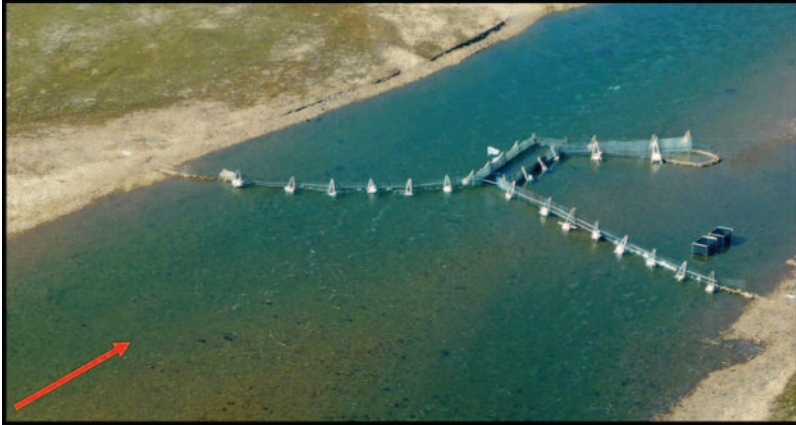
FIGURE 2. Aerial view of the weir across the Halokvik River, Victoria Island, Nunavut, used in 2013 as part of an Arctic Char ( Salvelinus alpinus ) population assessment. The red arrow indicates the upstream direction of migration. Photo courtesy of Denise LeBleu Images.