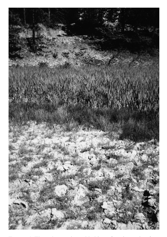
FIGURE 4. The ephemeral pond habitat of Psilocarphus brevissimus var. brevissimus south of Princeton, British Columbia. Myosurus minimus, Plagiobothrys scouleri and Polygonum aviculare are also prominent species on the calcareous clay soils. The adjacent bands of vegetation consist mainly of Meadow Barley ( Hordeum brachyantherum ) in the foreground and Common Cattail ( Typha latifolia ) in the background.

Douglas, G. W., D. Meidinger, and J. Pojar. 1999. Illustrated flora of British Columbia. Volume 4. Dicotyledons (Oroban-