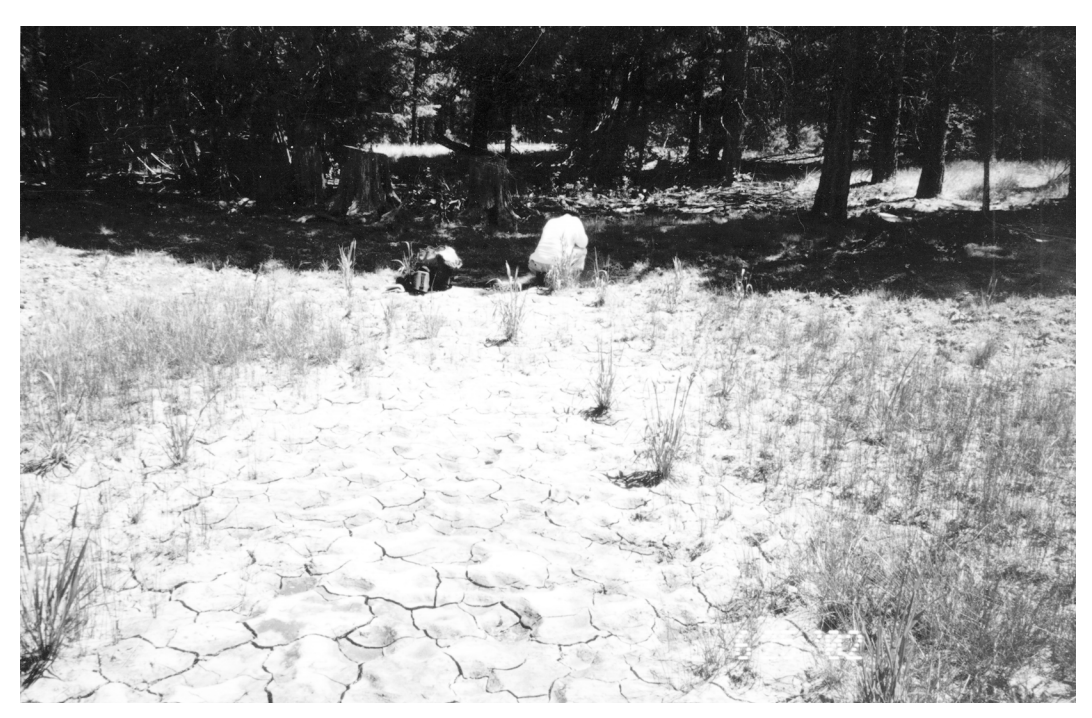
FIGURE 3. Calcareous vernal pool habitat of Psilocarphus brevissimus var. brevissimus south of Princeton, British Columbia. Colorado Rush ( Juncus confusus ), another rare species in British Columbia, is conspicuous on both sides of the dried-up vernal pool. The several large plants in the habitat are the introduced grass, American Sloughgrass ( Beckmannia syzigachne ).

cultural Land Commission 2003*). On these lands, development pressures do not appear to be an immediate issue at this time. The Agricultural Land Reserve status may prevent subdivision development, but does allow other activities that could also potentially threaten the populations. In recent years many tracts of Agricultural Land Reserve land in southern British Columbia has been converted to housing developments, shopping malls and golf courses, either by decisions of the Agricultural Land Commission or very rarely by an "order in council" by the sitting provincial legislature.