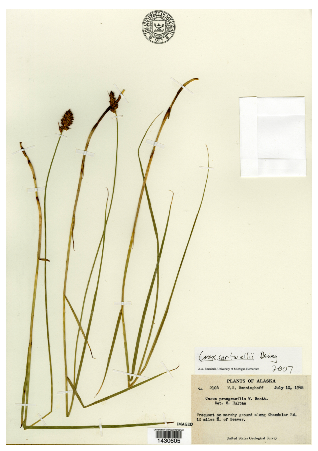
Figure 3. Specimen (MICH 1430605) of Carex sartwellii collected by W. S. Benninghoff and identified and mapped as C. praegracilis in Hultén (1968).