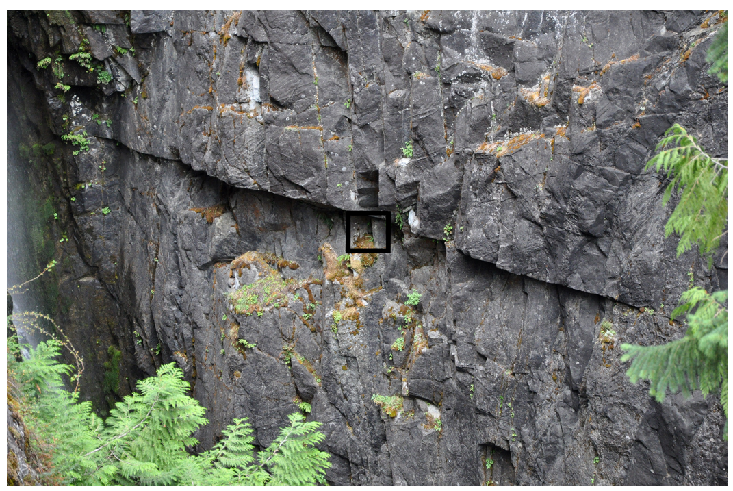
FIGURE 3. Nest location of Black Swift ( Cypseloides niger ) at Highfalls Creek Falls, denoted by the black square in the center of the image. 25 July 2015.

mend conducting daytime nest searches in late July and August to avoid high water flow, and they noted that adult nest attendance was more frequent in the 12 days after hatching.