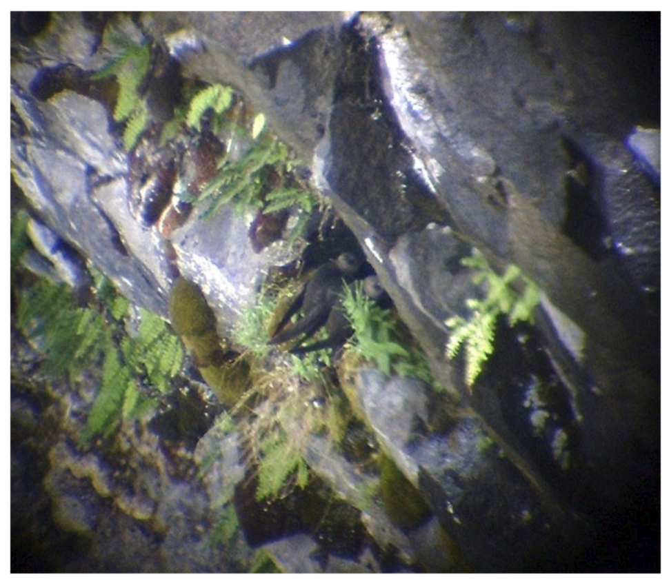
FIGURE 2. Two adult Black Swifts (Cypseloides niger) attending the nest at Brandywine Falls, 2 August 2004.

The Black Swift nest at Brandywine Falls was revisited each breeding season 2009–2015 (Table 1). The same nest used in 2004 was reused in 2009, 2012, 2013, 2014, and 2015, but was not active on 10 August 2010, and the nest could not be viewed on the 30 June 2011 visit due to high water levels obscuring the nest. Adult Black Swifts were seen flying into the active nest in 2004, 2009, and 2012.