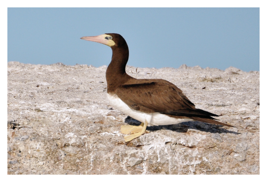
FIGURE 2. Adult female Brown Booby ( Sula leucogaster ) sitting on Donnelly's Pier, Buffalo, New York, 9 October 2013.

From its clean brown and white plumage, it was apparent that the Great Lakes bird was an adult and, from the yellowish face and gular with an isolated dark blue loral spot, a female (Figure 2; Pyle 2008). Pyle (2008) also states that females of S. l. leucogaster show a pale bluish iris and the brown head and breast slightly darker or more blackish than the back, whereas S. l. brewsteri has a pale yellowish iris with the brown head and neck slightly paler and grayer than back. Before Pyle (2008) published these characteristics, it was generally believed that field identification of Brown Boo-