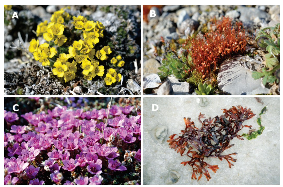
FIGURE 2: Diverse specimens from the Cunningham Inlet area, Somerset Island, Nunavut: A) Flat-top Draba ( Draba corymbosa R. Brown ex de Candolle), Sokoloff 245 ; B) Ptychostomum wrightii , Sokoloff 187 , C) Purple Mountain Saxifrage ( Saxifraga oppositifolia L.), Sokoloff 181 , D) Fucus distichus , Sokoloff 140 .

bers), Woo and Zoltai (3 numbers), Shindman (1 number), and Consaul and Archambault (11 numbers) and report all except Savile's for the first time. Some material was examined and identified by specialists, who are listed in the acknowledgements.