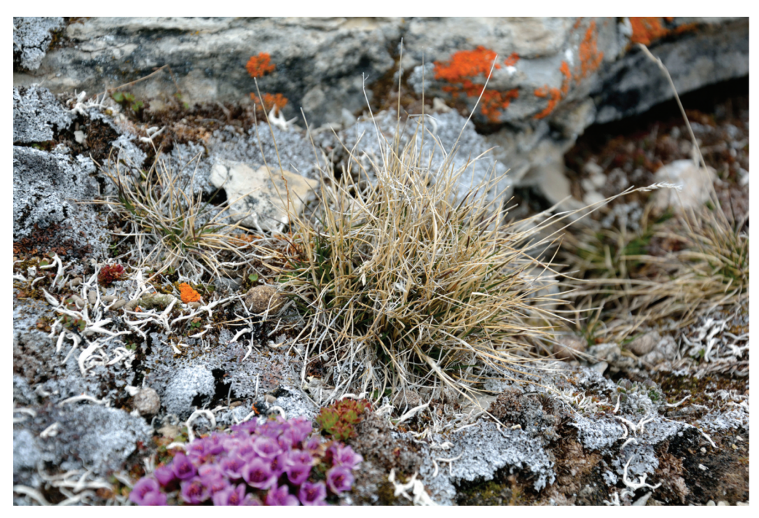
FIGURE 3: Edlund's Fescue (Festuca edlundiae S.G. Aiken, Consaul & Lefkovitch) in habitat at the top of cliffs overlooking Gull Canyon, Somerset Island, Nunavut (Sokoloff 128).

The summer of 2013 was unusually cold and late in the Canadian high Arctic (NASA 2013*), which delayed the flowering time of many species we encountered. Many species found on the open tundra had just begun their yearly growth, and the Purple Mountain Saxifrage, a benchmark spring ephemeral species in the Arctic, was still in full bloom when I left Cunningham Inlet. Although this resulted in taxonomically useful plant specimens rarely collected in flower (i.e., Saxifraga oppositifolia and Salix arctica), care should be taken to look for late-flowering specimens and specimens with fruits on subsequent visits to Cunningham Inlet. Thus, although comparisons between past and current vascular plant communities at this site are impossible given the paucity of earlier collections, in the future Cunningham Inlet could be used to monitor floristic change in the high Arctic using this inventory as a baseline, while keeping an eye out for any additions to the flora that would have been missed because of their later flowering time.