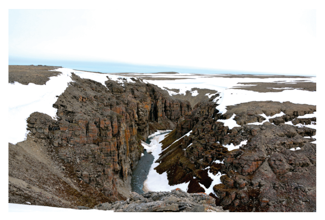
FIGURE 4: Habitat of Smooth Draba ( Draba glabella Pursh) at Gull Canyon, Somerset Island, Nunavut. Draba glabella ( Sokoloff 134 ) was collected at the base of the cliffs on the right side of the canyon.

a second report in this volume is apparently a typo, a repetition of a collection made on Sugluk Island just off the coast of Quebec). These central islands are primarily polar desert (including the study site at Cunningham Inlet) and consist of shattered limestone with minimal tundra cover (Savile 1959; Bliss et al. 1984).