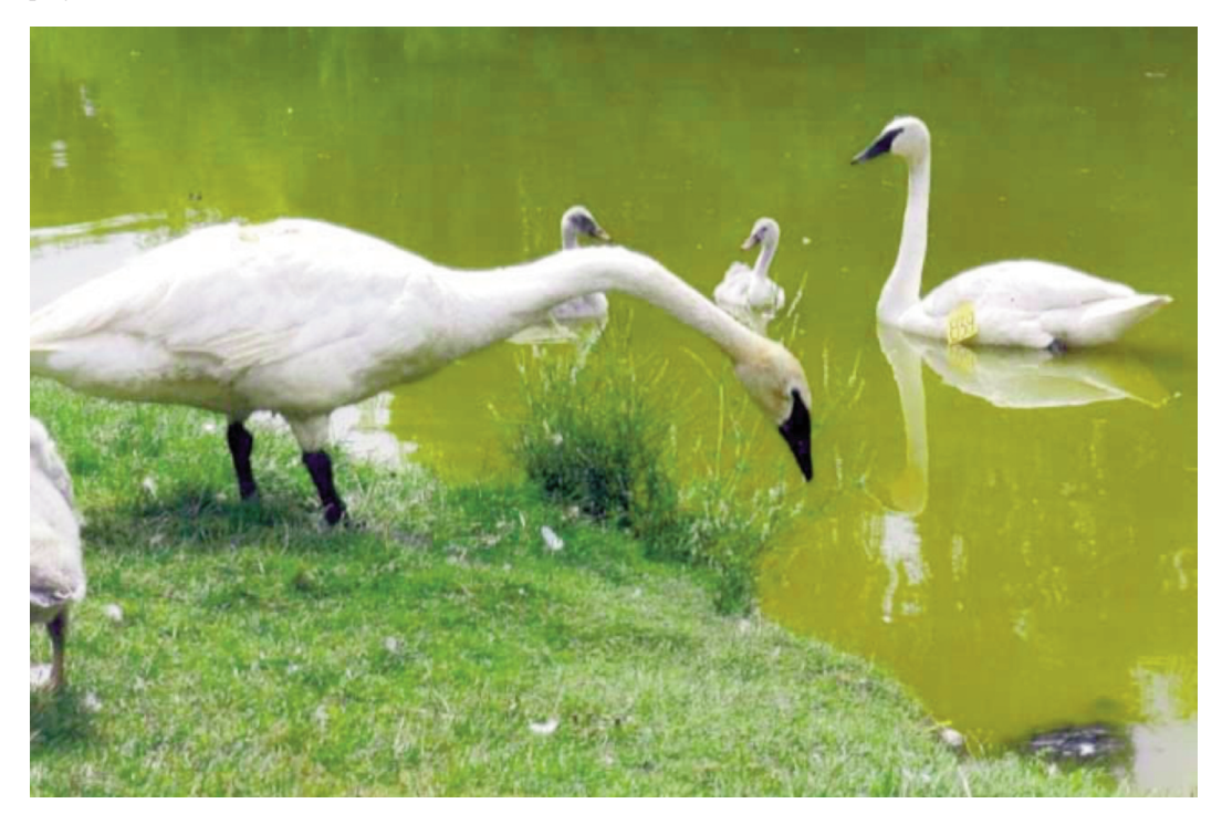
FIGURE 1. Forward posture of a Trumpeter Swan ( Cygnus buccinator ) at Aurora, directed at a Snapping Turtle ( Chelydra serpentina ), visible at the edge of the water in the lower right-hand corner. 5 August 2011.

On 17 June 2011, three swans (male 090 followed by female C04 and the three-year-old male, H09) were moving together close to the far western shore. Trumpeter Swan 090 started to stamp, presumably on a Snapping Turtle, which I could not see. During pauses, he started a duet (see below) with female C04, with notes spaced less than 1 second apart. About 0.3 seconds after C04 had responded, male H09 joined and added to the