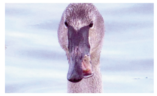
FIGURE 3B. Frontal view of the cygnet from La Salle Park showing bill deformities that prevented full occlusion of the bill. Photo: At La Salle Park by J. Kee. 7 February 2011.