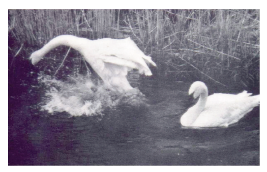
FIGURE 6. Water treading display by a male Trumpeter Swan ( Cygnus buccinator ). Reproduced from de Vos. 1964. Observations on the behaviour of captive Trumpeter Swans during the breeding season. Ardea 52: 166–148. Used with permission.

During the water treading display, the aggressor does not trumpet while it stamps vigorously and with loud splashing, raising the forepart of its body, shaking its wings, and extending its neck forward (Figure 6). There is broad similarity between the water treading display and the stamping behaviour.