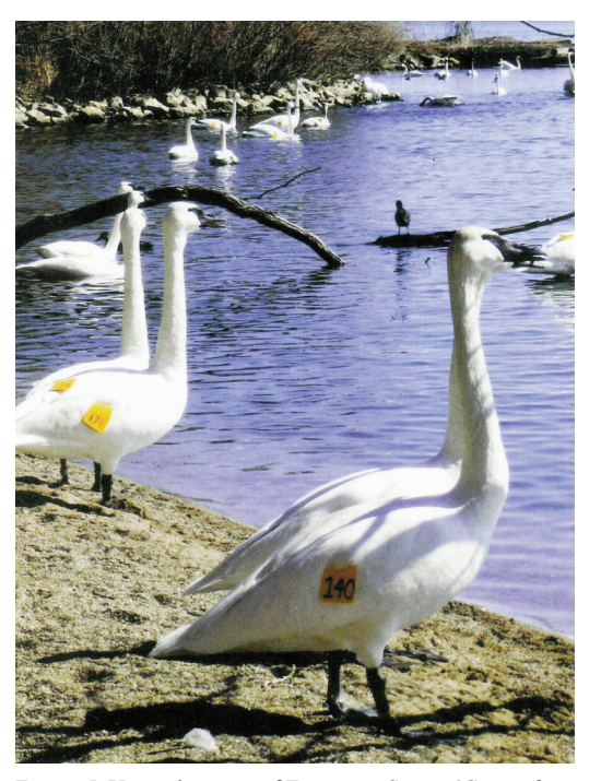
FIGURE 5. Upward posture of Trumpeter Swans ( Cygnus buccinator ) at La Salle Park, adopted when duetting or when startled by a domestic dog. 22 March 2011.

The stamping behaviour may have evolved from a very similar Trumpeter Swan behaviour that de Vos (1964) described as the water treading display. This threat display is usually directed at an intruder at the boundary of a territory. For example, in the Aurora study area, injured Trumpeter Swans were occasionally confined in a small pen at the corner of the main