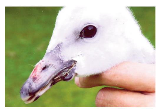
FIGURE 2A. Trumpeter Swan (Cygnus buccinator) cygnet from Newmarket, Ontario, showing injuries to its bill caused by a Snapping Turtle (Chelydra serpentina). Photo: At Aurora by H. Lumsden. 28 July 2011.

"duet". Thus these three companions participated in a pattern that often involves only two birds.