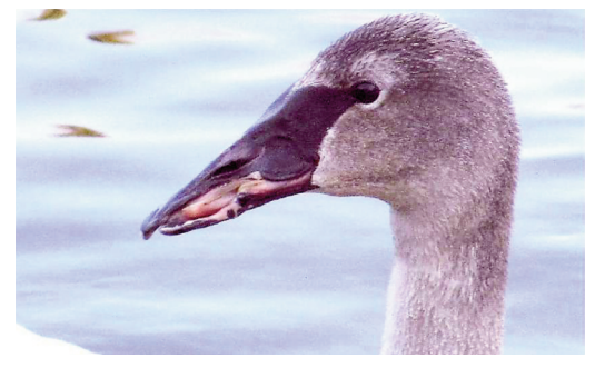
FIGURE 3A. Trumpeter Swan ( Cygnus buccinator) cygnet from La Salle Park, Burlington, Ontario, showing injuries to its bill, presumably caused by a Snapping Turtle ( Chelydra serpentina). The cygnet's age was about seven months.