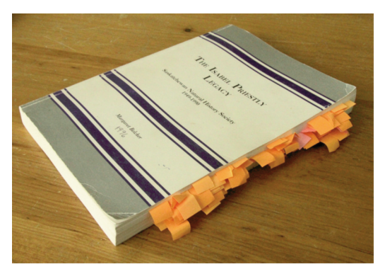
FIGURE 3. Pages marked with numerous Ledingham references in the history of the Saskatchewan Natural History Society (Belcher 1996).

Anonymous. 2006. The plant man: George Ledingham's 60year project. Degrees 18(2): 21–25.